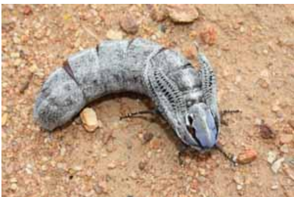
Female cossid moth with short wings.

This moth was found and photographed in August by Melissa Cundy on a road north of Wubin.