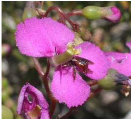
Bee trapped under trigger.