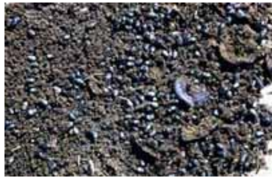
Cowpat with swarms of introduced Onthofagus binodis .

Onthophagus binodis . This species was introduced to SW Australia from South Africa. James reported how someone on a surf ski had caught herring which had eaten introduced dung beetles flying out to sea when dispersing.