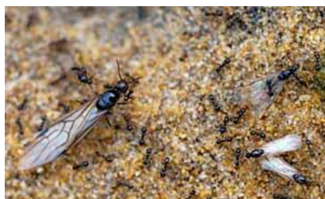
Ants, Anonychomyrma itinerans perthensis , preparing for nuptial flight.

These ants, Anonychomyrma itinerans perthensis , I am told, are very common in Perth bushlands, but they do not normally persist in disturbed areas.