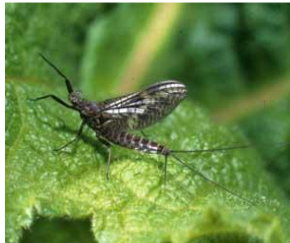
Adult mayfly with long trailing tails.

The main part of the life of mayflies is in the nymphal, or larval stage, which lives in ponds and rivers. Most are active swimmers, and cling onto sticks or stones where they graze on algae.