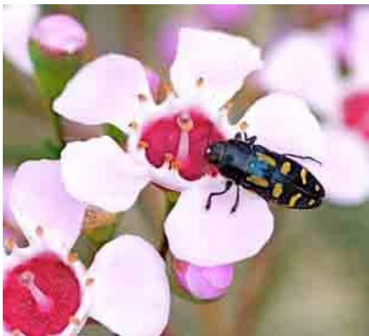
Jewel beetle, Castiarina picta.