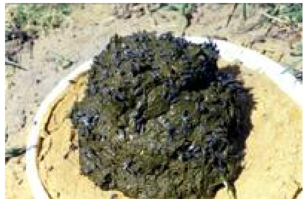
Bushflies covering cowdung prior to the release of dung beetles.

Before exotic dung beetles were introduced into SW Australia during the 1980s, cow dung accumulated in pastures, smothering grass and breeding billions of bush flies. The introduced beetles were mainly from Africa and Europe. A total of 43 species were released, 23 of which became established. These have made a significant improvement in nutrient cycling on pastureland as well as a huge reduction in the populations of dung-breeding flies.