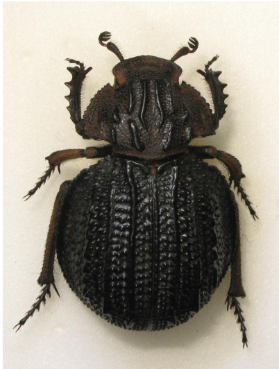
A flightless trogid beetle, Omorgus rotundulus, from the Little Sandy Desert.