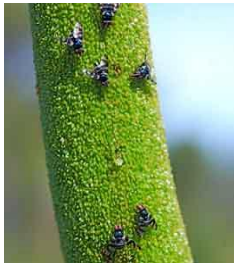
Flies on a grass tree flower spike.

In early September I went to Inglewood Triangle, a small area of remnant bushland in Inglewood. Flies were present on the emerging grass tree spikes and this spike had about 25 flies on it. The flies have a marvellous likeness to jumping spiders, due to the markings on the wings and the colouration of the head appendages, which look like the abdomen of a spider. I wonder what was attracting the flies to the grass tree spike.