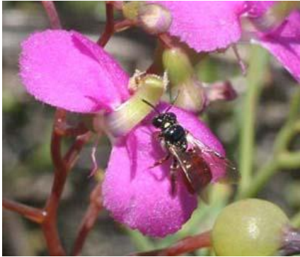
Native bee on triggerplant flower.

This native bee was feeding on the triggerplant, Stylidium scandens and became trapped under the trigger. The plant was flowering late at Cheyne Beach in December.