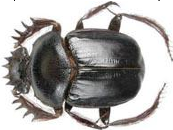
The Sacred Scarab, Scarabaeus sacer .

Scarabaeus sacer . In this species there is male and female cooperation. The females dig a tunnel up to one metre deep and, after making a small hole in the brood mass and spitting into it, lay an egg there. These dung beetles are found all around the Mediterranean but since the 1980s have become less common. This species is the sacred scarab from ancient Egypt. It was noticed that these large beetles come out of the soil in spring during times of rains, so they were associated with reincarnation. They also make perfect spheres of dung which they roll, just like the god Khepera or Ra rolls the sun around the sky.