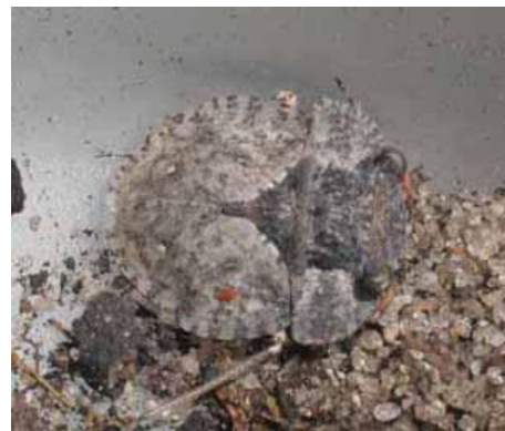
Toad bug, Nerthra sp. from Cape Riche.

A toad bug was found to be common on the sand plain around Cape Riche. This one had several parasites, probably erythraeid mites.