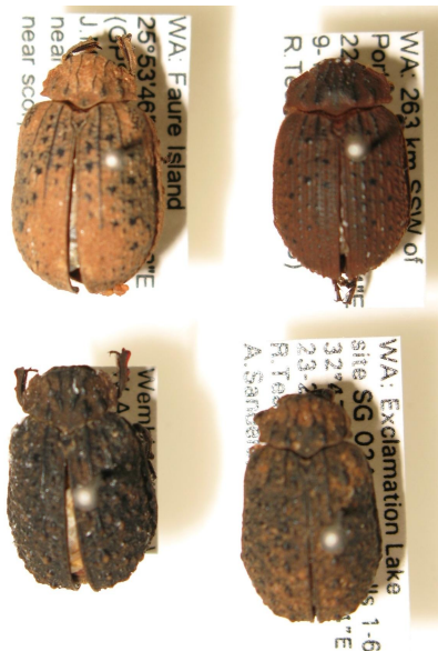
Normal winged trogid beetles showing dirt-stained bodies and separation of the wing cases.

These beetles are usually dull black, warty, dust-covered and range from about 10 to over 30 mm in length. Most species are associated with vertebrate carrion, adults and larvae feeding on the hair or feathers and dried skin and muscle. Larvae of these carrion-feeders are white curl-grubs as in most other ‘scarabs’ and live in burrows in the soil beneath carcasses. Some other trogids have been found breeding in vertebrate burrows and nests, on the castings of predatory birds and in bat guano. One American species has been reported to feed on dead insects.