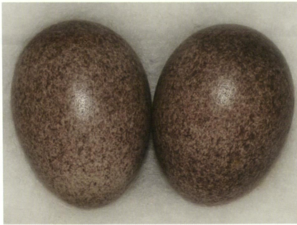
Figure 2 Clutch of bristlebird eggs (accession number BE03383) from the H.L. White Collection, Museum of Victoria, said to have been collected near Jarnadup, Western Australia.

pattern varies considerably in bristlebirds, sometimes even within a clutch. These characters are therefore not very useful for distinguishing between bristlebird species. However, on the basis of colour, pattern and shape, the Jarnadup eggs do appear to be from one of the bristlebirds.