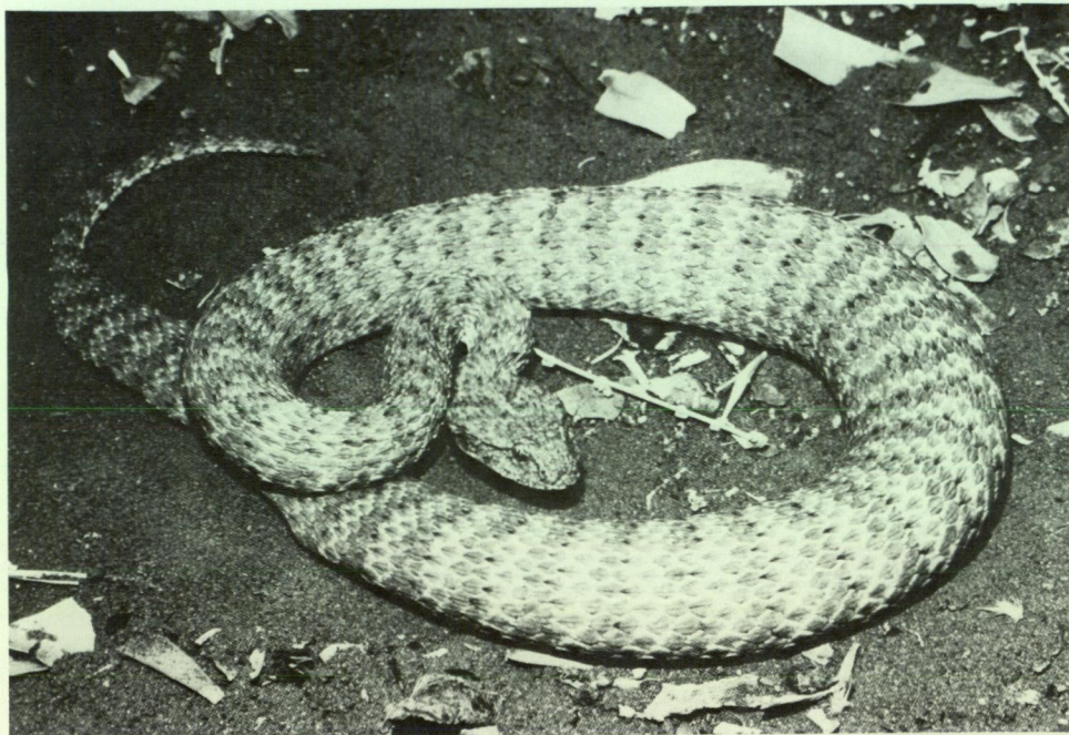
Fig. 3: An Acanthophis pyrrhus from Giralia.

Dorsal ground colour reddish-brown. Body and tail with 50-70 pale reddish-brown or brownish-white cross-bands; on posterior edge of bands usually a series of black or dark brown spots. Lips and lower surfaces whitish.