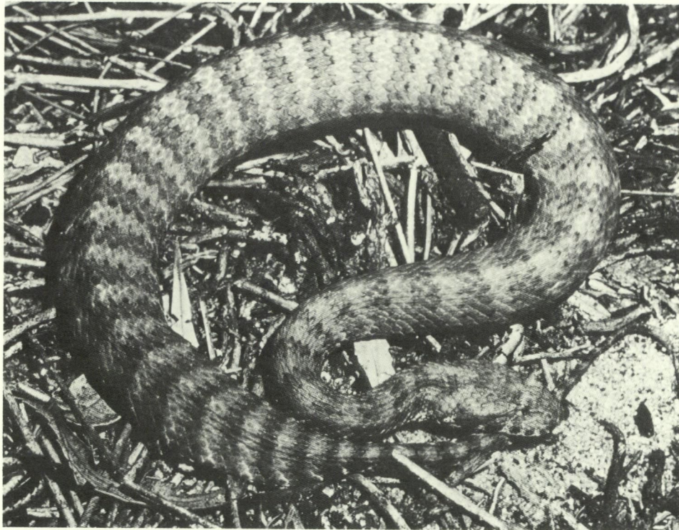
Fig. 4: An Acanthophis praelongus from 45 km NNE of Halls Creek