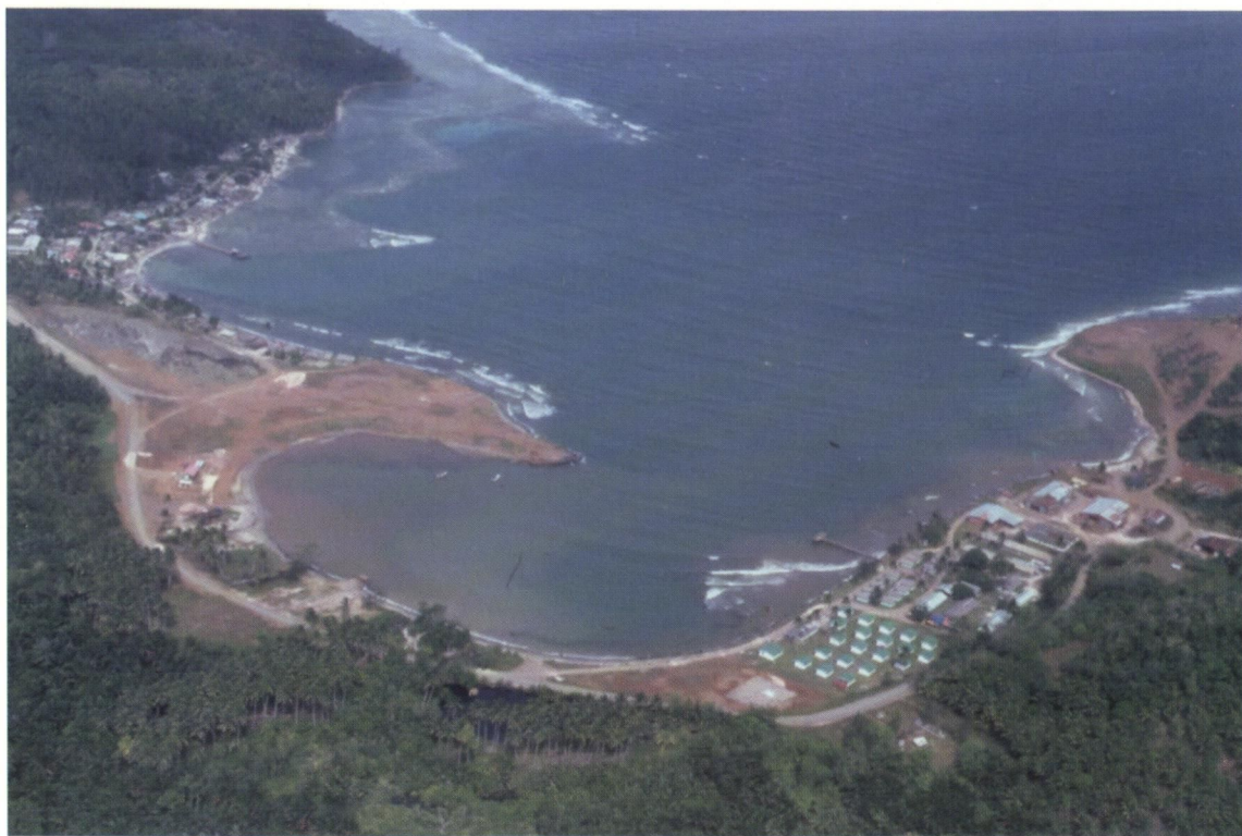
Figure 2 Gambir Bay, with BHP Camp on right and village backed by kebun on left.