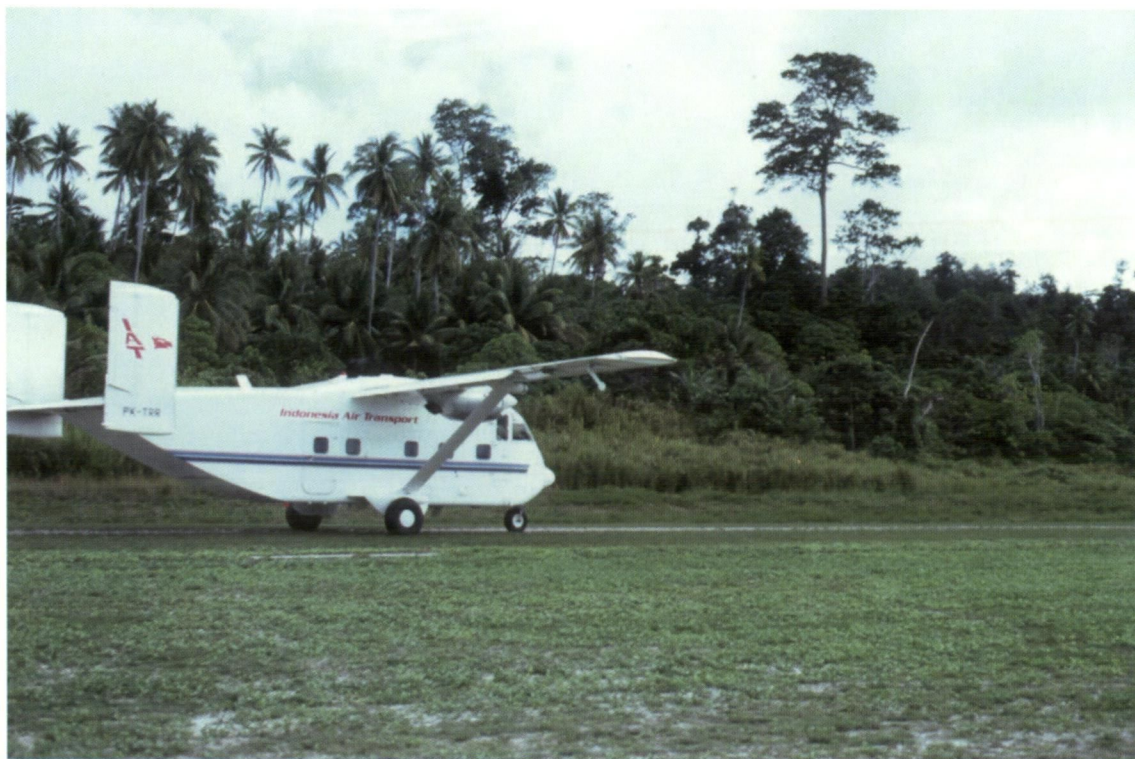
Figure 3 Airstrip with rank herbage and kebun.