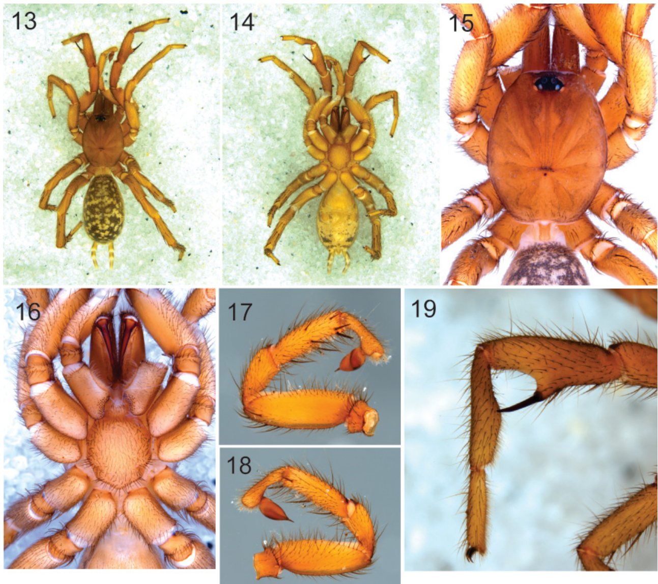
FIGURES 13–18 Chenistonia boranup sp. nov., holotype male (WAM 92/97): 13, dorsal view; 14, ventral view; 15, dorsal view of carapace; 16, ventral view of sternal area, note maxillae and cuspules; 17, left palp prolateral; 18, left palp retrolateral; 19, left leg I retrolateral tibia, metatarsus and tarsus.