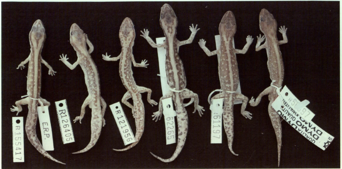
Figure 4 Specimens of Lucasium bungabinna sp. nov. showing the range of variation seen in dorsal pattern. From L-R: WAM R155417, WAM R126405, WAM R121956, SAMA R62265, SAMA R61197 and SAMA R56597.

In life, little different from colour in preservative (cf. Figures 3 and 4). Essentially just two dorsal colour tones; a medium sand-brown dorsal colour marked with pale beige dorsal stripe and lateral spots. Underside pure white.