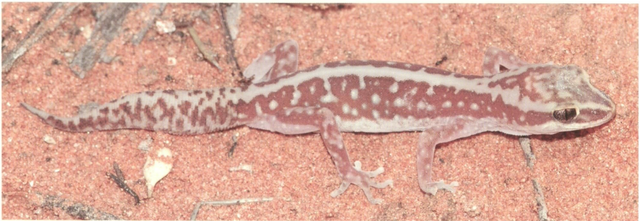
Figure 3 Specimens of Lucasium bungabinna sp. nov. in life. (A) holotype adult male (WAM R166888) from Bungalbin; (B) paratype adult female (SAMA R61197) from the vicinity of Lake Ifould, SA.

ossification lying next to the posterior tip of the maxilla; cf. Oliver et al. 2007, figure 4G). Fourth finger of manus has five phalanges.