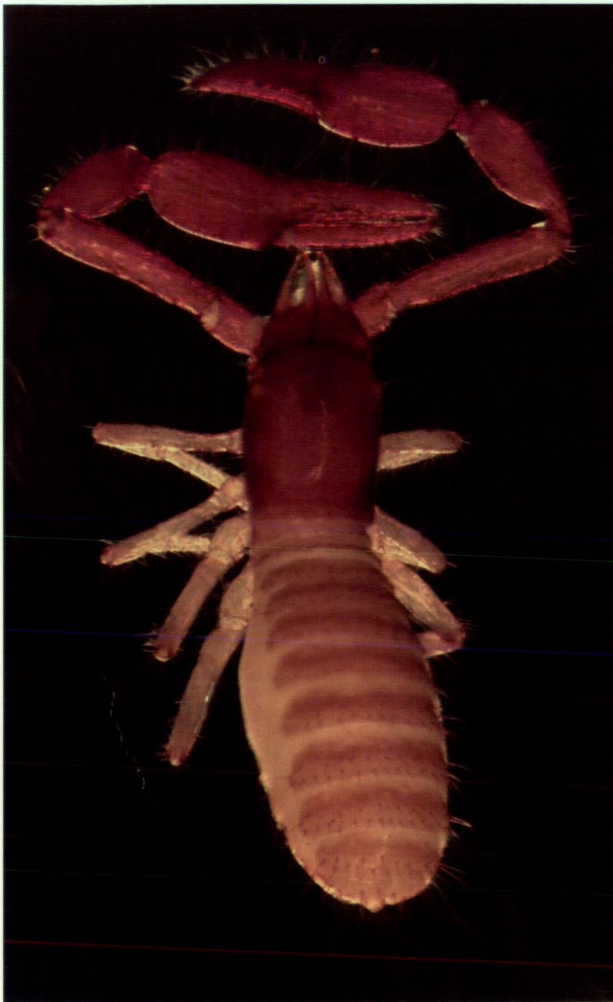
Figure 1 Parahya submersa (Bristowe), female from Steep Head Island, Western Australia (WAM T62566).

Obisium submersum , Singapore, and New Caledonia. The Australian records represent a slight range extension, indicating that P. submersa has a wider distribution in the Australasian region than previously recognised. The record of Microcreagris sp. from Récif Croissant, New Caledonia by Bigot (1992) appears to be based upon the same specimens identified by Harvey (1991b) as P. submersa .