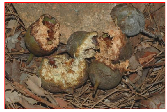
Marri nuts chewed by Forest Red-tailed Black Cockatoo