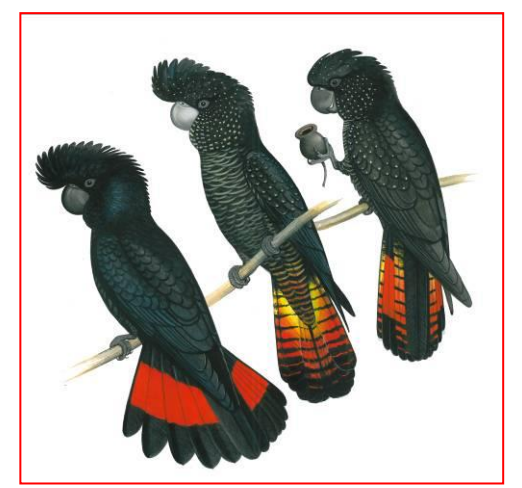
Male (left), Female (centre), Juvenile (right)