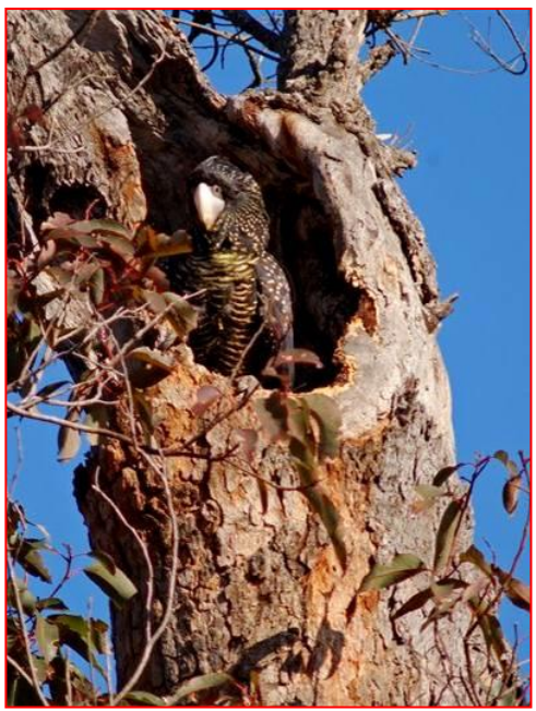
Female Forest Red-tailed Black Cockatoo at nest