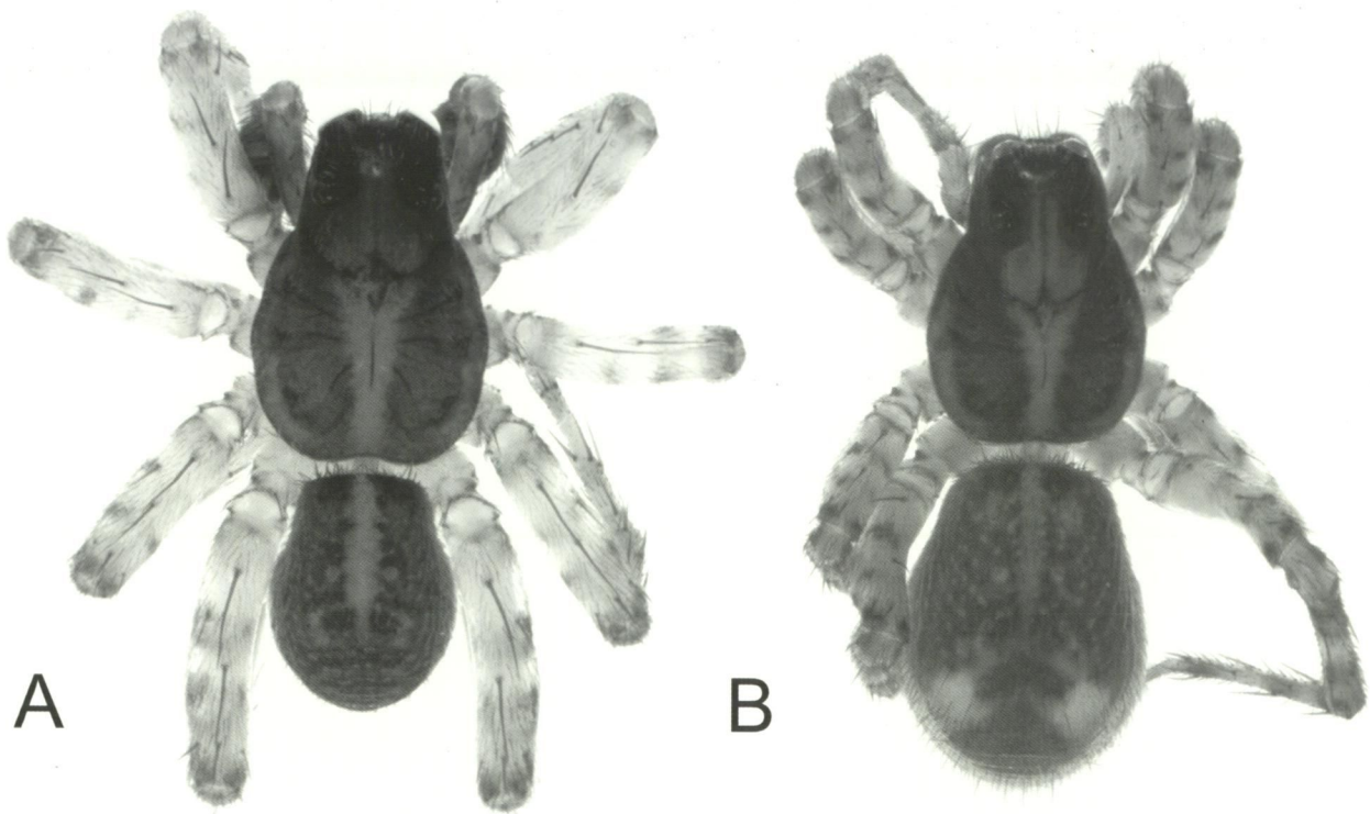
Figure 1 Artoria linnaei sp. nov. A, male holotype (WAM T88459); B, female paratype (WAM T88460), both from Glenbourne Farm, Western Australia. Body length: A, 3.27 mm; B, 4.50 mm.

T64062); 1 ♂, Mullaloo Beach, 6km at 15deg, 31°47'S, 115°44'E (WAM T65611); 1 ♂, Nedlands, 7 Kingston St, 31°57'56"S, 115°48'46"E (WAM T53831); 1 ♀, Parmelia, 32°14'S, 115°50'E (WAM T55241); 1 ♀, same locality (WAM T55425); 1 ♀, same locality (WAM T65073); 10 ♂, 3 ♀, 2 juveniles, Perth Airport, 31°58'34"S, 115°56'25"E (WAM T68662); 2 ♀, same locality (WAM T68663); 3 ♂, 1 juvenile, same locality (WAM T68672); 13 ♂, 9 ♀, 1 juvenile, same locality (WAM T68675); 7 ♂, 5 ♀, Perth Airport, 31°58'03"S, 115°58'11"E (WAM T68653); 6 ♂, 10 ♀, 2 juveniles, same locality (WAM T68664); 1 ♂, 4 ♀, 1 juvenile, same locality (WAM T68670); 1 ♀, same locality (WAM T68676); 1 ♀, Perth Airport, 31°58'05"S, 115°58'05"E (WAM T56403); 5 ♀, same locality (WAM T68657); 3 ♂, 7 ♀, same locality (WAM T68682); 3 ♀, same locality (WAM T88484); 5 ♂, 2 ♀, Perth Airport, 31°58'36"S, 115°58'28"E (WAM 99/6-11); 36 ♂, 13 ♀, 10 juveniles, same locality (WAM T68656); 4 ♂, 2 ♀, 1 juvenile, same locality (WAM T68658); 1 ♀, Perth Airport, 31°55'24"S, 115°58'40"E (WAM T55491); 1 ♀, same locality (WAM T55503); 1 ♀, Perth Airport, 31°55'25"S, 115°58'40"E (WAM T55504); 1 ♂, Pinnaroo Valley Cemetery, 31°47'52"S, 115°46'43"E (WAM T64089); 4 ♂, Reabold Hill, 31°57'S, 115°46'E (WAM T42143); 1 ♀, same locality (WAM T56174); 19 ♂, 8 ♀, same locality (QM S64096); 1 ♂, South Bunbury, Punchbowl Caravan Park, 33°20'S, 115°40'E (WAM T56175); 6 ♂, 6 ♀, 3 juveniles, Talbot Road Reserve, 31°52'05"S,