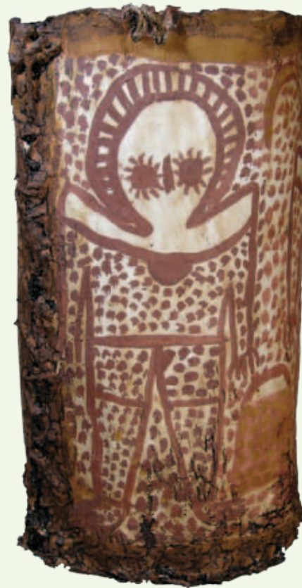
Western Australian Museum – Perth Perth Cultural Centre, James Street, Perth

The Museum is conveniently located in the Perth Cultural Centre and within walking distance to the Perth train station. Schools might like to consider combining their Museum excursion with a visit to the Art Gallery of Western Australia or the State Library of Western Australia .