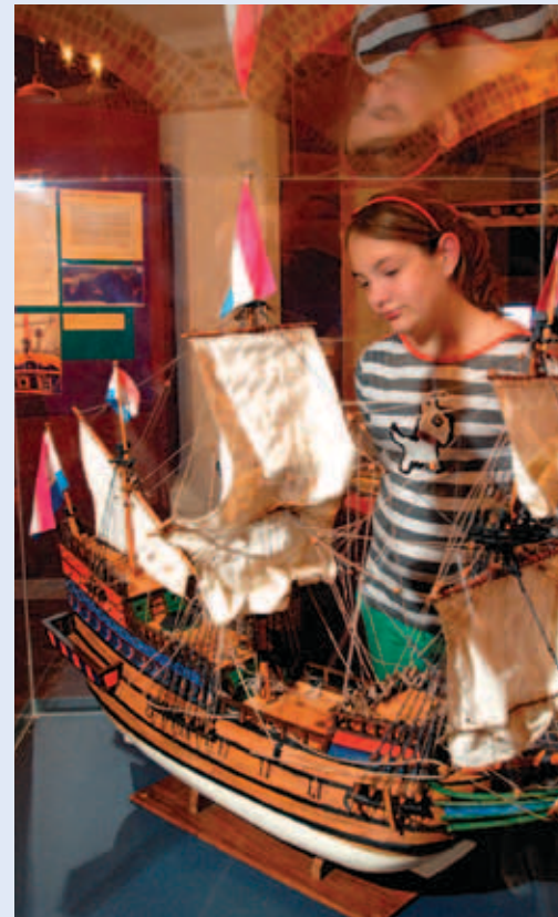
Western Australian Museum Shipwreck Galleries Cliff Street, Fremantle

The Museum is located within Fremantle's historic West End precinct. It is home to hundreds of shipwreck relics from Western Australia's maritime past, from the 17th century to the early part of last century. Schools might like to consider combining their Museum excursion with a visit to the Western Australian Museum – Maritime , for a whole day's experience of Fremantle.