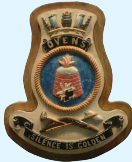
Western Australian Museum – Maritime Victoria Quay, Fremantle