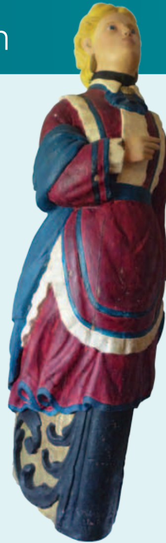
Western Australian Museum – Albany Residency Road, Albany

Meet live local Long-necked Turtles, different species of frogs, King’s Skinks and varied bird life within our grounds, the site where Minang people fished and cooked and Western Australia was first proclaimed. Learn about our rich maritime history, threatened species, traditional Minang life and the amazing marine habitats of our southern seas.