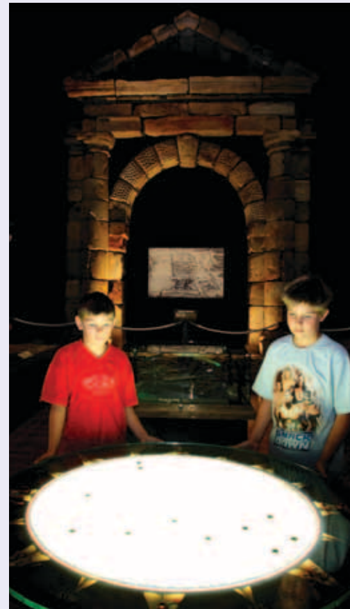
Western Australian Museum – Geraldton Museum Place, Batavia Coast Marina, Geraldton

Open 9:30am - 4:30pm on school days (excluding Wednesdays)