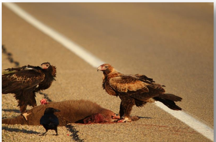
Adult (L) and immature (R) at a roadside kangaroo carcass.