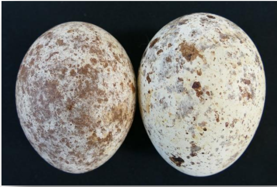
Typical clutch of two eggs showing differences in coloration (darker egg laid first).