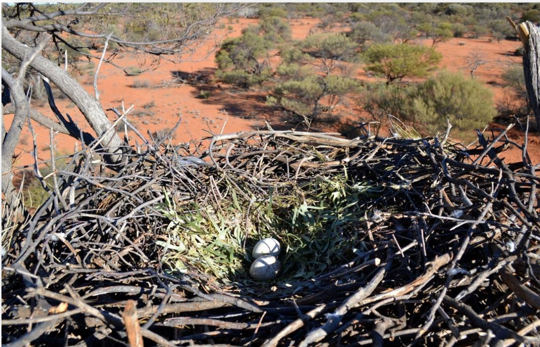
High in the landscape, a typical nest of sticks lined with green leaves with a clutch of two eggs.

Johnstone, R.E. and Storr, G.M. (1998). Handbook of Western Australian Birds . Volume 1 – Non-passerines (Emu to Dollarbird). Western Australian Museum pp. 142–144.