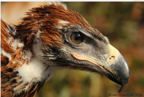
Immature showing massive bill, reddish plumage and pale gape.