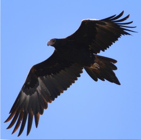
The distinctive wedge-shaped tail is evident from a great distance.