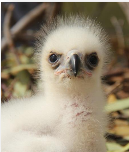
Nestling covered in white down.