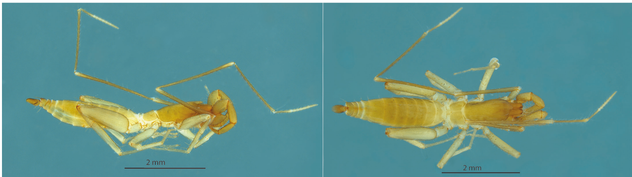
FIGURES 2–3 Paradraculooides eremius sp. nov., male holotype (WAM T114968), lateral and dorsal views, respectively. Scale bar = 2 mm.