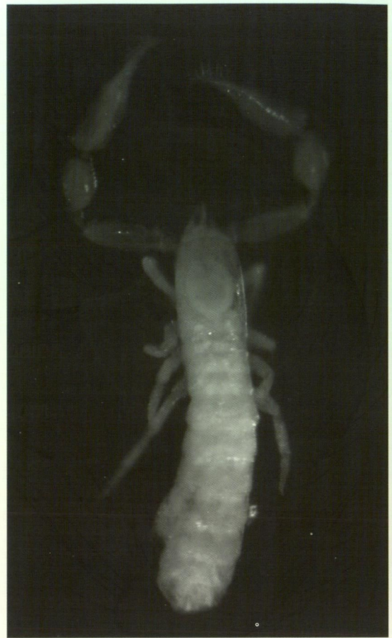
Figure 1 Ideoblothrus linnaei sp. nov., holotype male (WAM T81373).

Chelicera: 5 setae on hand (Figure 6), all setae acuminate, is , ls , sbs , and bs long, es very short; movable finger with 1 sub-distal seta; fixed finger with ca. 9 small teeth; movable finger with ca. 7 small teeth; with 2 dorsal lyrifissures and 1 ventral lyrifissure; galea straight, extending to tip of finger; rallum of 5 blades, distal blade broadened and finely denticulate; serrula exterior with 20 blades.