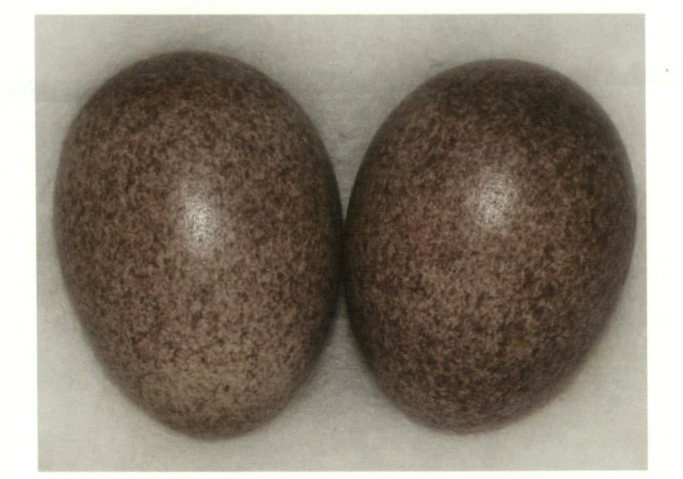
Figure 2 Clutch of bristlebird eggs (accession number BE03383) from the H.L. White Collection, Museum of Victoria, said to have been collected near Jarnadup, Western Australia.

pattern varies considerably in bristlebirds, sometimes even within a clutch. These characters are therefore not very useful for distinguishing between bristlebird species. However, on the basis of colour, pattern and shape, the Jarnadup eggs do appear to be from one of the bristlebirds.