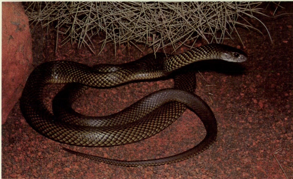
Figure 1 Top: A Pseudechis butleri from near Sandstone. Bottom: A Pseudechis australis from Nita Downs.