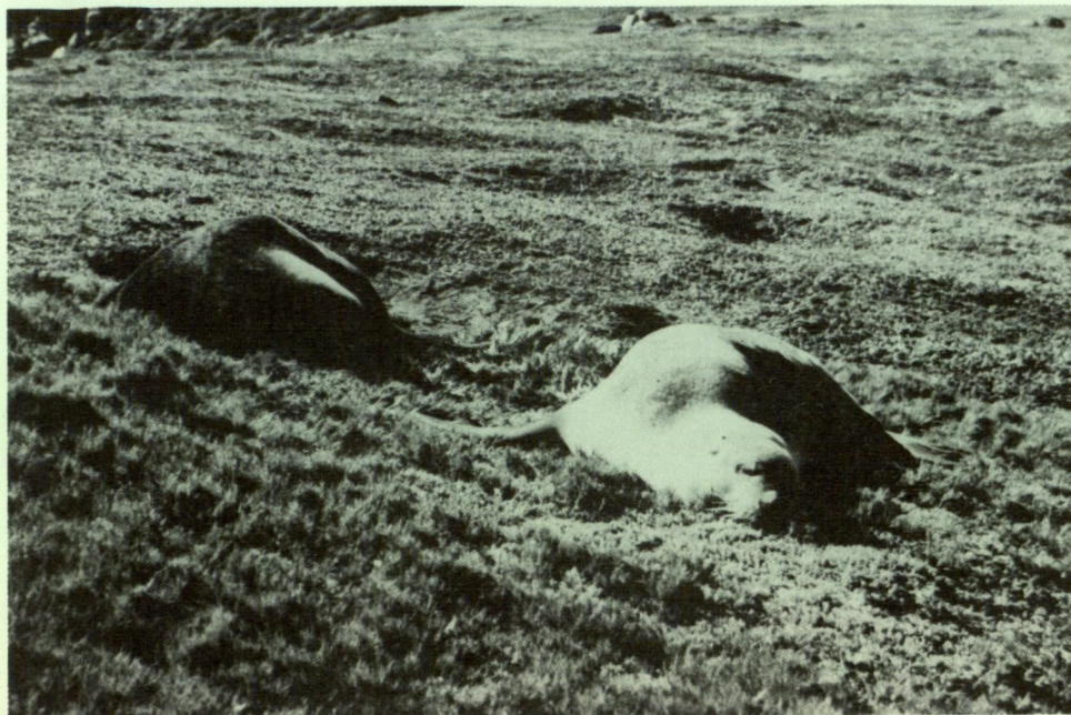
FIG. 3: Habitat of Sea lions on Middle Doubtful Island. Disphyma blackii herbfield, elevation about 30 m above sea level.

All Fur seals were recorded either in the water, on boulder islets close to the island, or on the rocky shoreline close to the water's edge. Sea lions were mainly encountered away from the shore in small groups (31 out of 41 animals). Fur seals were never observed lying close enough to touch one another (except pups suckling from their mothers), whereas Sea lions were usually clumped together. Presumably, the Fur seal with its dense underfur and black or dark brown coat is likely to suffer heat stress readily and so has to remain near water, whereas the Sea lion (with a paler and less dense coat) is not often under heat stress and so can move inland on islands or rest in clumps (Gentry 1973).