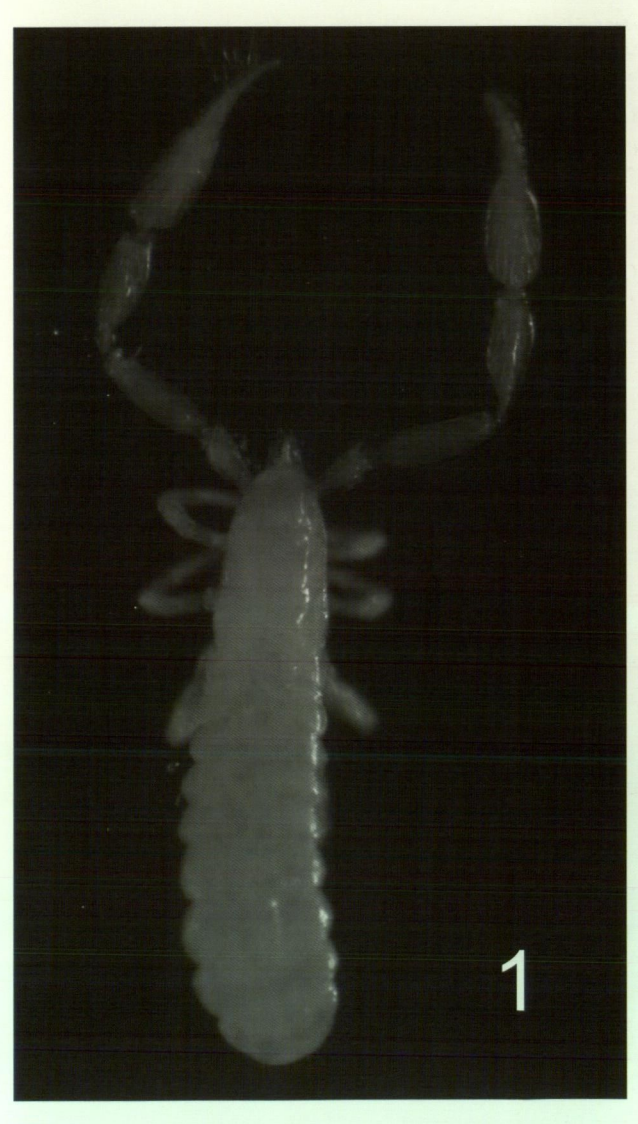
Figure 1 Linnaeolpium linnaei sp. nov., holotype male (WAM T82354).

that the type species of Xenolpium, X. pacificum (With 1907) from New Zealand, possessed leg morphology characteristic of the Olpiini requiring the automatic synonymy of the two tribes. In the meantime, Hoff (1964) included a third tribe - Hesperolpiini Hoff 1964 - within the Olpiinae based upon the long venom ducts within the chelal fingers, and the patella of leg I shorter than the femur, with a freely mobile joint. Hoff (1964) included Hesperolpium and Aphelolpium within the Hesperolpiini, which was augmented by the inclusion of Planctolpium Hoff 1964 by Muchmore (1979), previously described as a member of the Garypidae (Hoff 1964). Long venom ducts are also found in a variety of other olpiids: Apolpium Chamberlin 1930 (Chamberlin 1931; Tooren 2002; Harvey, personal observation), Calocheirus Chamberlin 1930 (Mahnert 1986, 2002), Cardiolpium Mahnert 1986 (Mahnert 1986), Ectactolpium Beier 1947 (Harvey, personal observation), Nanolpium Beier 1947 (Harvey, personal observation), Progarypus Beier 1931 (Mahnert 2001; Harvey,