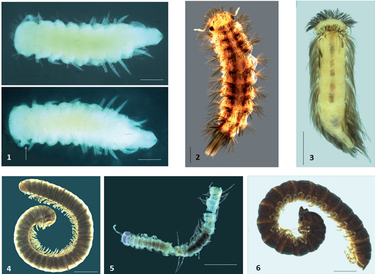
FIGURES 1–6 The millipedes on Barrow Island: 1, Lophoturus madecassus (Marquet and Condé, 1950) (WAM T110380), top, dorsal view; bottom, ventral view, showing antenna (arrow); 2, Unixenus mjoebergi (Verhoeff, 1924) (WAM T107716); 3, Phryssonotus novaehollandiae (Silvestri, 1923) (WAM T114011); 4, Speleostrophus nesiotus Hoffman, 1994 (WAM T76951); 5, Haplodesmidae (genus and species indet.) (WAM T116231); 6, Boreohesperus dubitalis Car and Harvey, 2013 (WAM T123094). Scale bar = 0.2 mm (Figure 1), 0.5 mm (Figures 2, 3), 2 mm (Figures 4, 5), 1 mm (Figure 6).

Australia: Western Australia: Barrow Island: Site 17 , 20°47'38"S, 115°27'24"E, 10 individuals, post