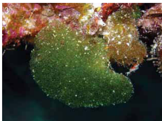
Figure 3 Rhipilia nigrescens , a spongy green alga found in reef front habitats.

Representative specimens were collected from each location and preserved in 5% Formalin/seawater (2006 surveys) or pressed directly on herbarium sheets on-site (2007). These specimens have been lodged in the State Herbarium (PERTH). Additional material was also preserved in 100% Etoh (green algae) or dried in silica gel (red algae) for DNA analysis. Locations visited during the URS 2006 survey are listed in Table 2. Table 5 gives the presence of individual taxa at each location observed during the WA Museum survey of 2006.