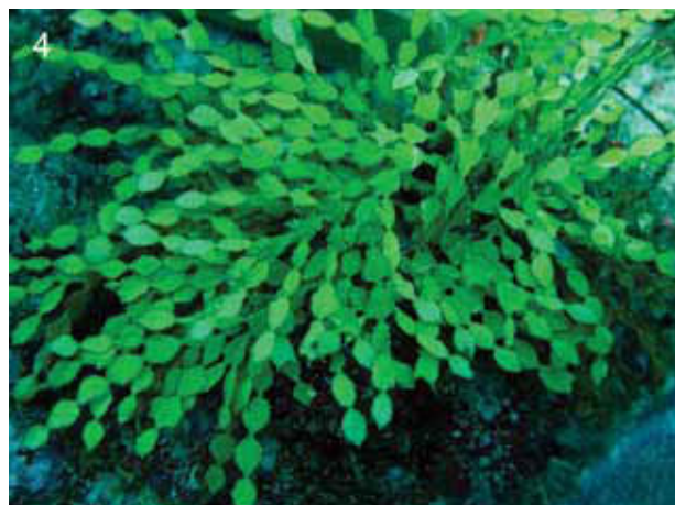
Figure 4 Halimeda minima , common in shaded areas in most habitats.