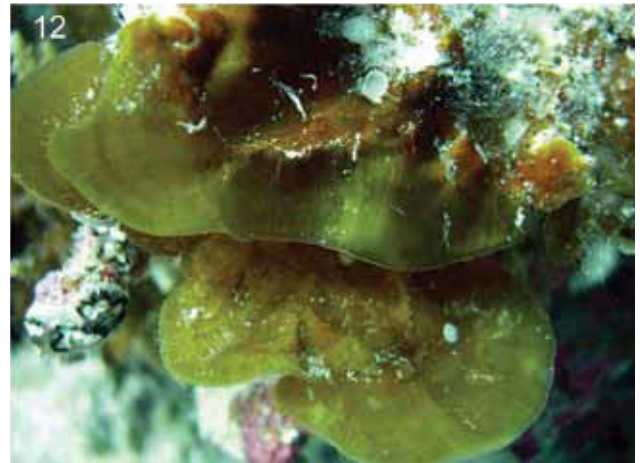
Figure 12 Lobophora varegiata , common in lagoonal habitats.