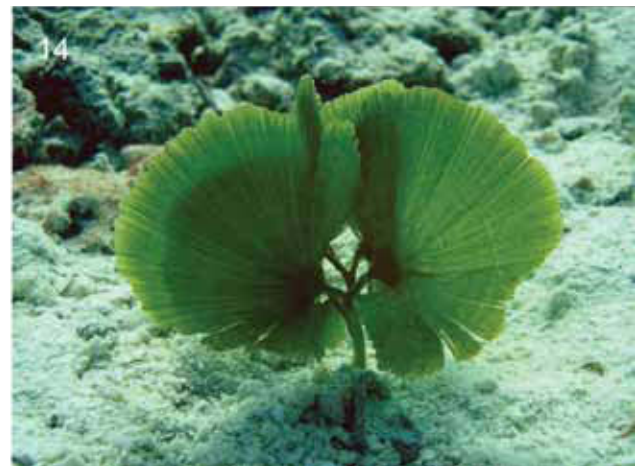
Figure 14 Udotea glaucescens , a fan shaped green alga.

Verheij & Prud'homme van Reine 1993). However, much of the Indo-Pacific region is also currently poorly known, particularly so tropical northwestern Australia where, up until some 8 years ago, less than 30 algal species were recorded (Huisman et al. , 1998). Ongoing studies are rapidly changing this situation and presently the known (but mostly unpublished) northwestern Australian flora totals over 350 species. Specimens of possibly another 100 species have been collected, but these are as yet unidentified (unpublished obs.). Thus any assessment of the Rowleys/Scott/Seringapatam algal floras must be viewed against this backdrop, acknowledging that there is much that is still unknown.