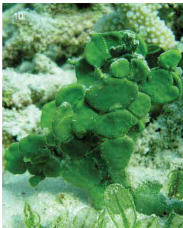
Figure 10 Halimeda macroloba , a species restricted to sandy habitats