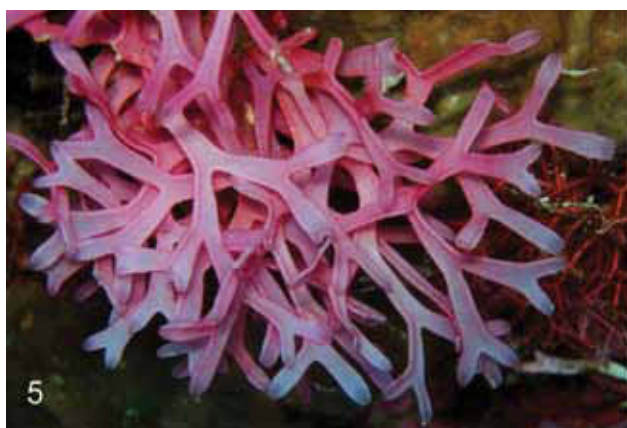
Figure 5 Dichotomaria marginata , generally in reef front habitats.