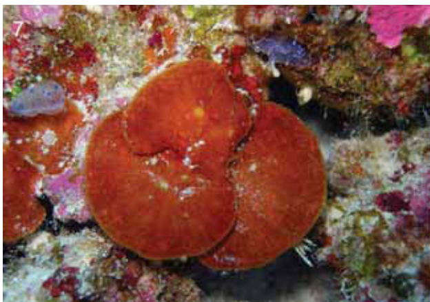
Figure 7 Peyssonnelia inamoena , on vertical walls in many habitats

Over 120 species of macroalgae and seagrasses are reported for the Rowley Shoals, Scott Reef and Seringapatam Reef. This represents a significant contribution towards documenting the marine flora of these reefs. Once the smaller, cryptic epiphytic algae are fully assessed, the species