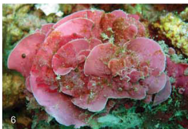
Figure 6 Rhizolamellia collum , restricted to dark crevices on reef fronts