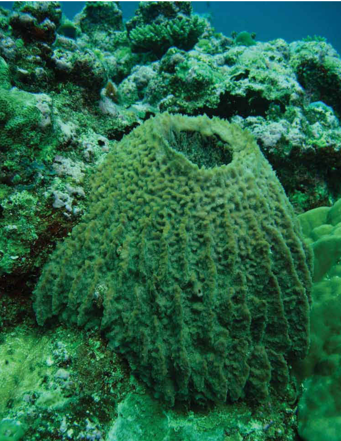
Above: The barrel sponge, Xestospongia testudinaria (Lamarck, 1815).