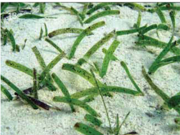
Figure 13 Thalassia hemprichii , occasionally in dense stands in sandy habitats