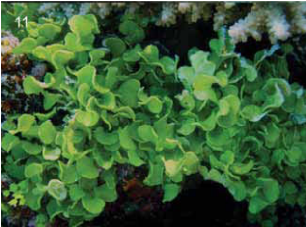
Figure 11 Halimeda macrophysa , with ruffled segments