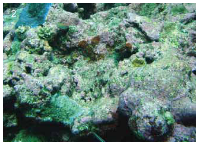
Figure 2. Hydrolithon onkodes , typical of high energy reef crests.