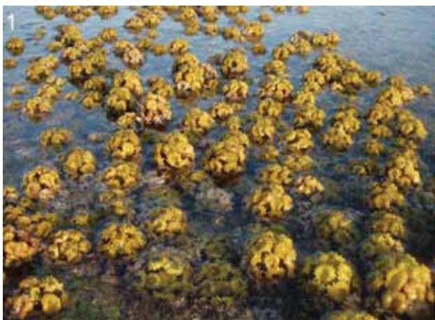
Figure 1 Turbinaria ornata , dense cover at Seringapatam Reef.

During each survey, the algal flora was assessed visually and by specimen collection, either by SCUBA, snorkelling or reef walking. SCUBA diving was only undertaken during the September 2006 and December 2007 surveys. Sampling