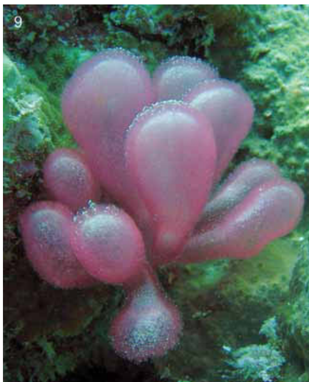
Figure 9 Gibsmithia hawaiiensis , an unusual gelatinous red alga.

The Indo-Pacific algal flora is very diverse and covers a large area. Some subsets of the region are regarded as biodiversity hotspots, for example the Philippines with some 900 species recorded (Silva et al. , 1987), but this high diversity often also reflects collection effort. Macroalgal studies in some regions have been ongoing for over a century (e.g. Indonesia, beginning with Weber-van Bosse & Foslie 1904) and these regions continue to be studied by primarily European botanists (e.g.