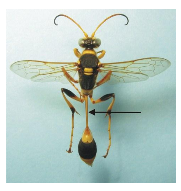
Slender mud-dauber wasp, Sceliphron laetum , showing characteristic stalk-like first segment of abdomen (or 'petiole'; arrowed). The bulbous hind section of the abdomen is known as the 'gaster'.

Members of this genus are easily distinguishable from other mud-nest builders by the extraordinarily thin, straight, stalk-like first segment of the abdomen, also known as the petiole (see image below). They are of moderate to large size (body length 17-26 mm) and largely black but with some areas yellow. They hunt spiders of various kinds as food for their larvae. All are solitary, each female building and provisioning its own nest. These wasps are usually inoffensive although females will sting if handled.