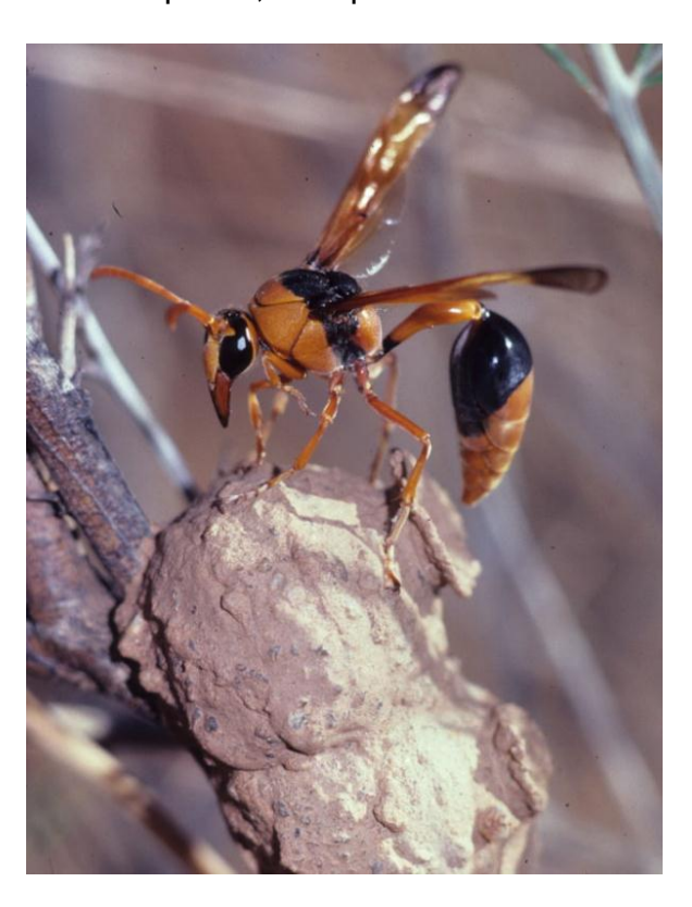
A female Delta on its characteristic vase-like mud cells.

The only other mud-nest builders in the Perth Region that have the abdomen strongly stalked are members of the genus Delta (family Vespidae). Delta differs from Sceliphron in the following stalk-like first segment ways: abdomen not straight and not of uniform thickness; wings held out sideways in a V-shape when insect is settled (not folded over the body); colouration more orange and black, rather than yellow and black (see image below); prey items are caterpillars, not spiders.