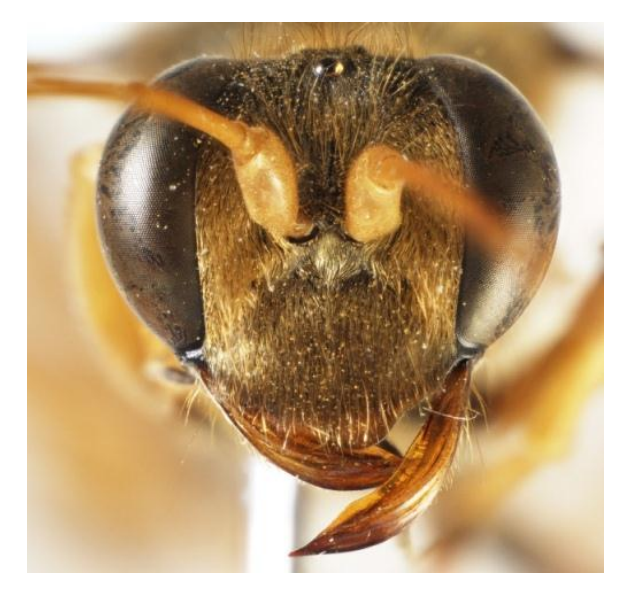
Fig. 1 Sceliphron laetum