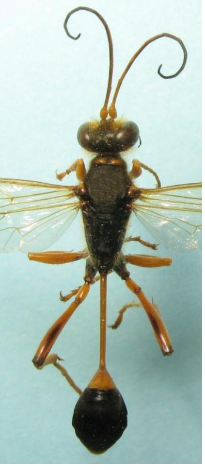
Fig. 4 Sceliphron unidentified