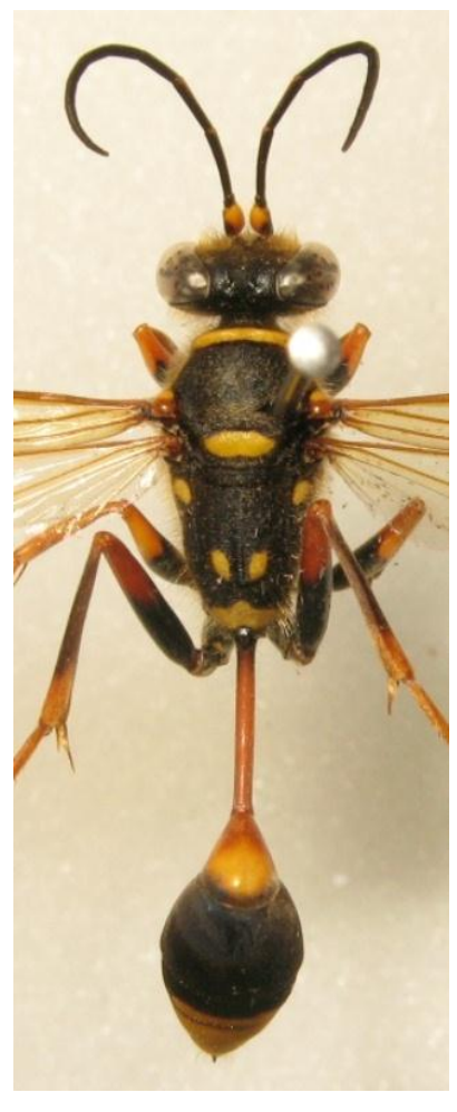
Fig. 5 Sceliphron formosum