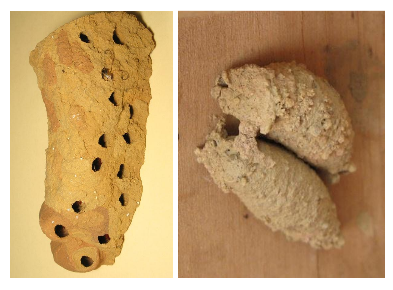
Fig. 8 Vacated nest of unidentified Sceliphron