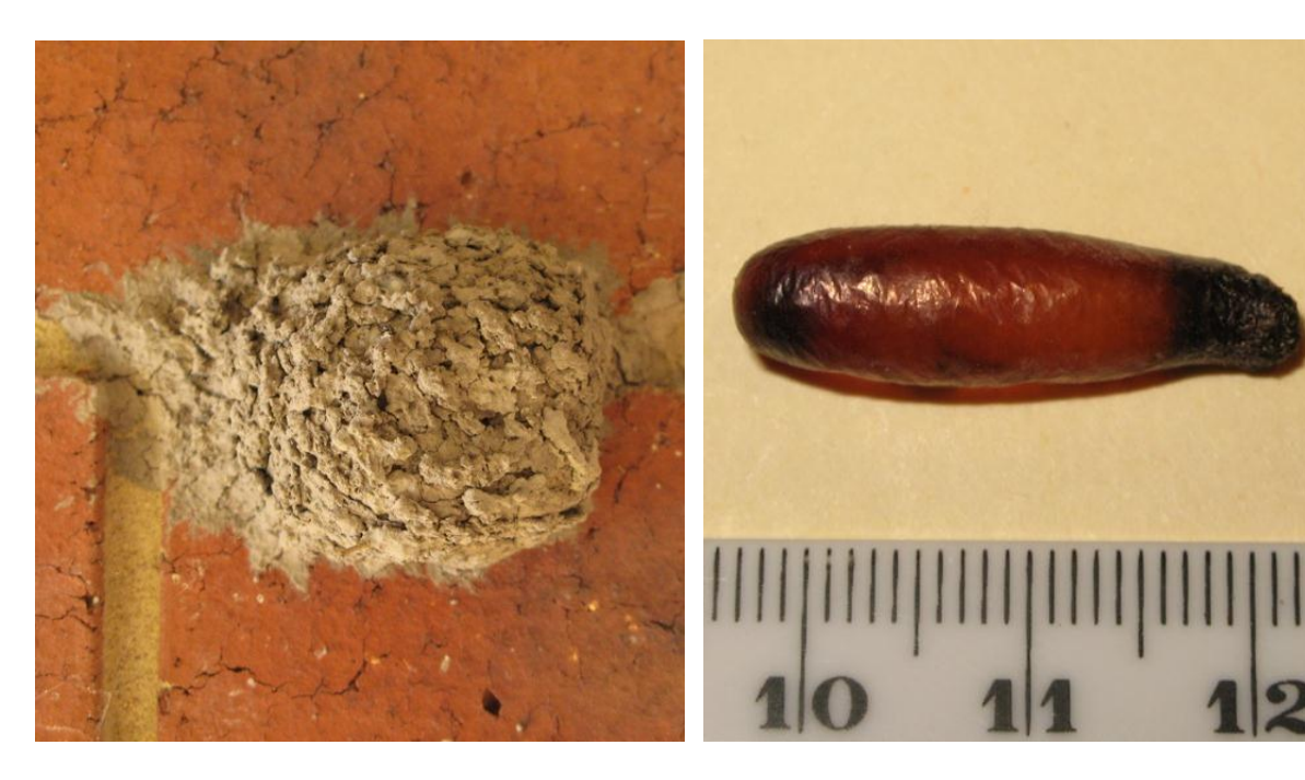
Fig. 6 Completed nest of S. laetum