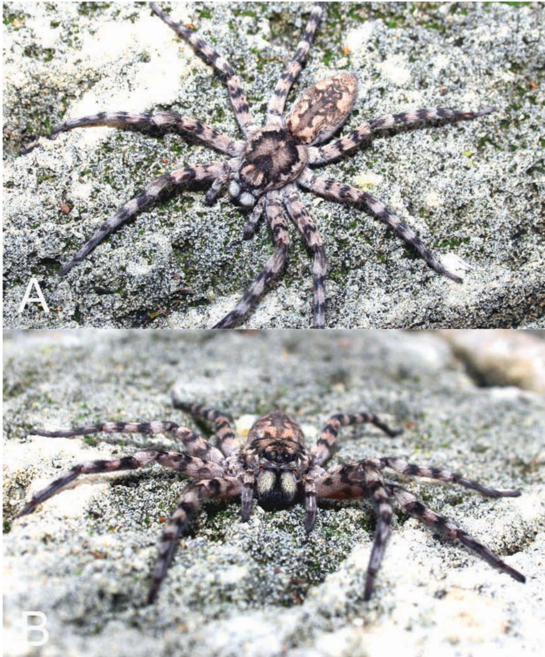
Figure 1 Tapetosa darwini sp. nov., immature from Lily McCarthy Rock (WAM T60365): A, dorsal and B, frontal view.

to celebrate the 200 th anniversary of Charles Darwin's birth in 1809 and the 150 th anniversary of the publication of his On the Origin of Species by Means of Natural Selection (Darwin 1859).