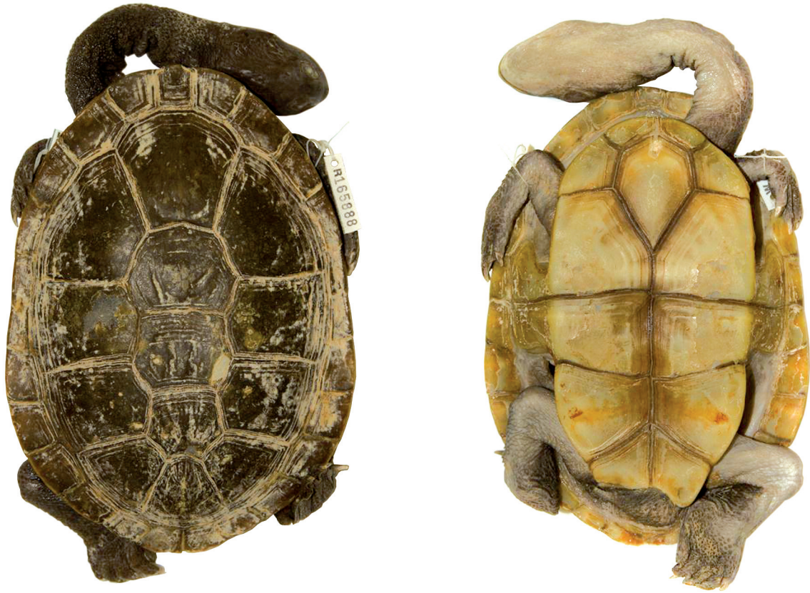
FIGURE 2 Chelodina mccordi timorlestensis , holotype (R165888).