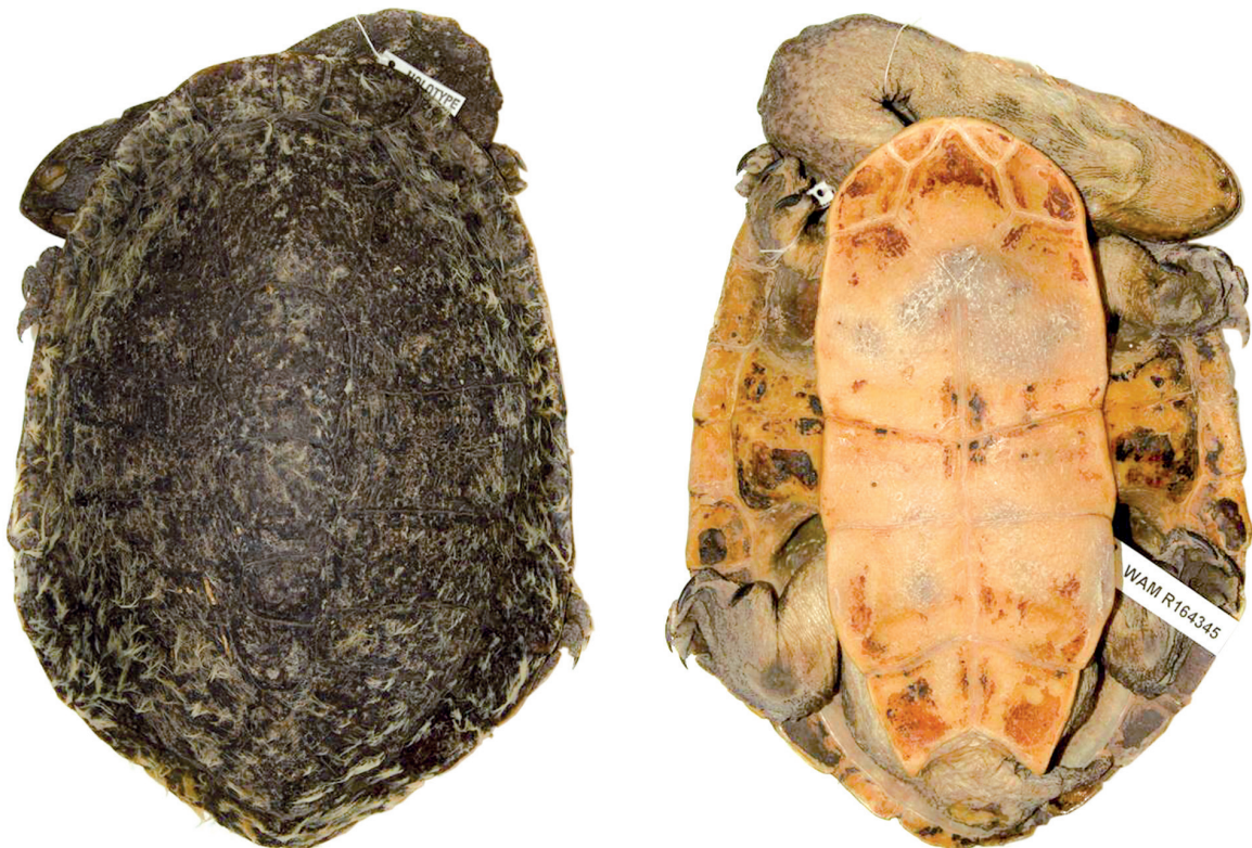
FIGURE 5 Macrochelodina walloyarrina , holotype (R164345).