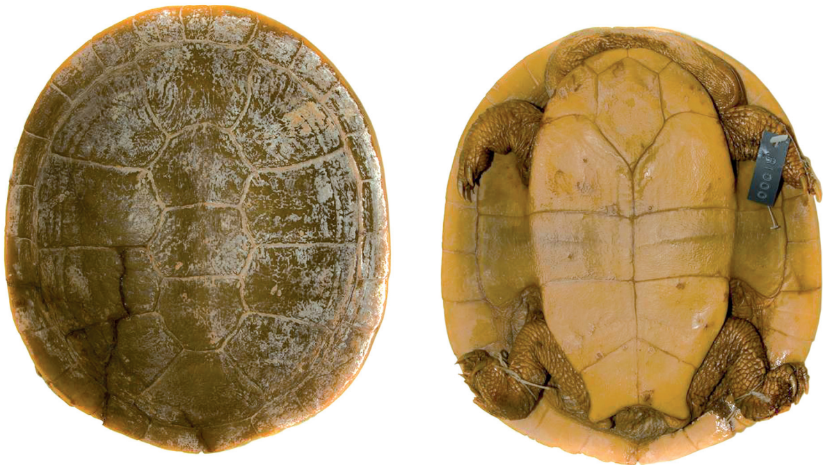
FIGURE 3 Chelodina milly-millyensis , lectotype (R1000).