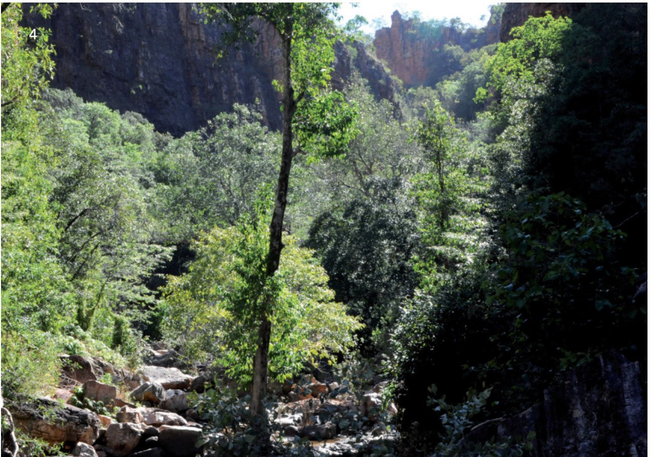
FIGURES 3–4 Monsoon forest along permanent springs: 3, El Questro Gorge; 4, Emma Gorge.