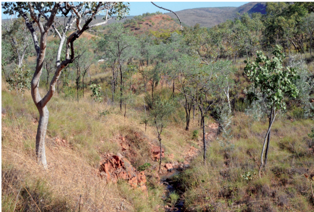
FIGURE 2 Savannah woodland along a dry gully, near Saddleback Ridge.

and includes information on occurrence, relative abundance, habitat preference and larval food plant associations, together with previously published records. The fauna is then placed in the context of what is known about the butterflies of the wider Kimberley region. Taxonomic remarks and comments are also made on five species from the region which have proven to be erroneous – these records are excluded from the Kimberley.