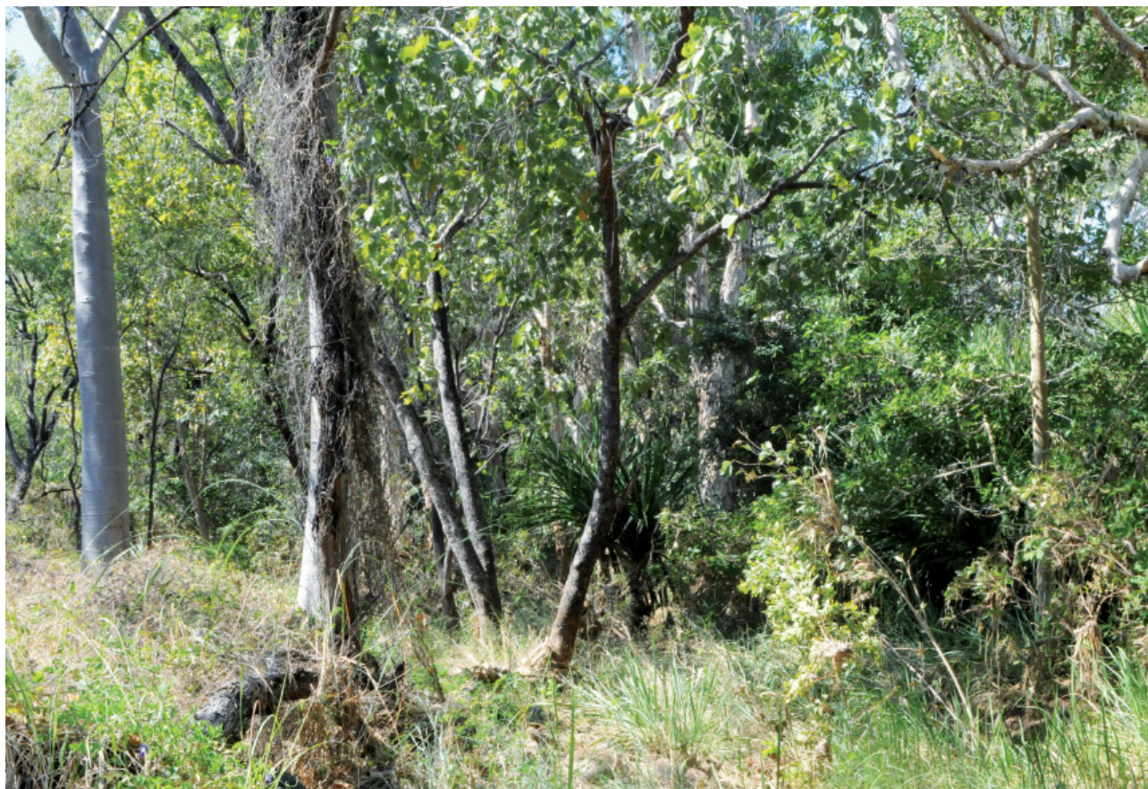
FIGURE 5 Riparian paperbark open-forest with rainforest elements in the understorey, Pentecost River.

period. Four of these sites were located in riparian areas along gorges/streams with permanent (flowing) water and patches of monsoon forest; the four others were located in savannah woodland along seasonal gullies/creeks that had no flowing water during the dry season. The numerical data for this survey will be reported elsewhere (M.F. Braby and M.R. Williams, unpublished data). Nomenclature for butterflies follows Braby (2010).