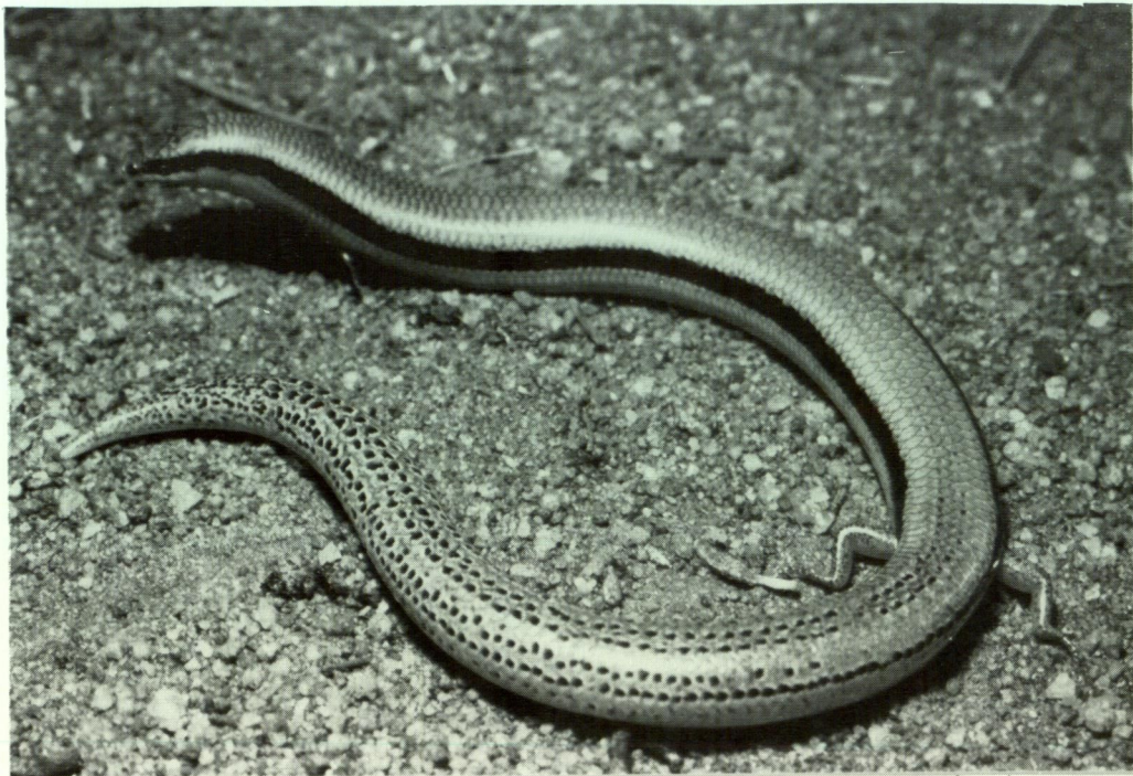
Figure 6 A Lerista desertorum from Big Shot Bore, photographed in life by G. Harold.

(65930-4, 72874) and 8 km SSE (72770, 72884) and 10 km SSE (65941-3, 72785-7); 67 km SE Blue Robin Hill (91461, 92030) and 70 km SE (92034, 92037; 45 km ENE Lake Colville (92032) and 39 km E (91910), 92031, 92035, 92050) and 40 km E (91912, 92036) and 42 km ESE (92027); 102 km NNW Forrest (91294-5, 92033, 92053) and 95 km NNW (92038) and 94 km NNW (91293, 92929); 48 km NNE Kitchener (96744) and 36 km NNE (96745).