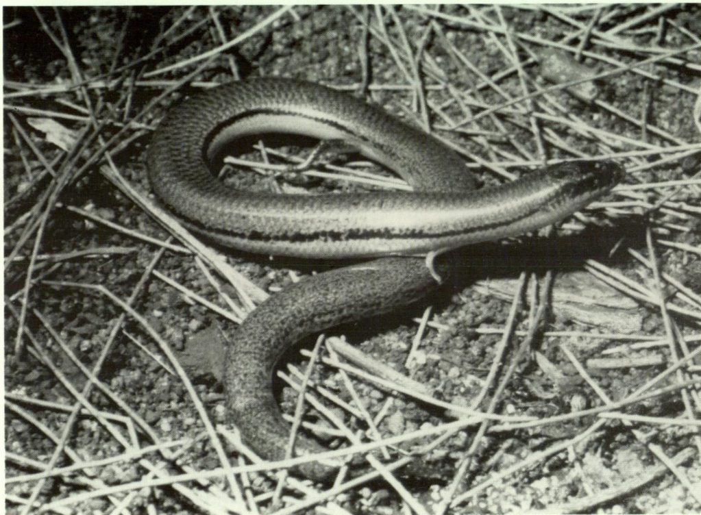
Figure 7 Holotype of Lerista axillaris , photographed in life by R.E. Johnstone.

A member of the L. macropisthopus group with 2 fingers, 3 toes and movable eyelids, most like L. macropisthopus but having a dark upper lateral stripe, yellow venter, more elongate body, shorter limbs and a much longer and deeper forelimb groove.