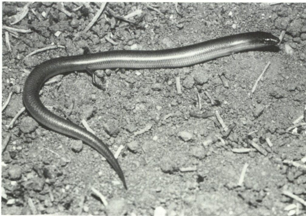
Figure 4 A Lerista macropisthopus galea from Galena, photographed in life by M. Peterson.