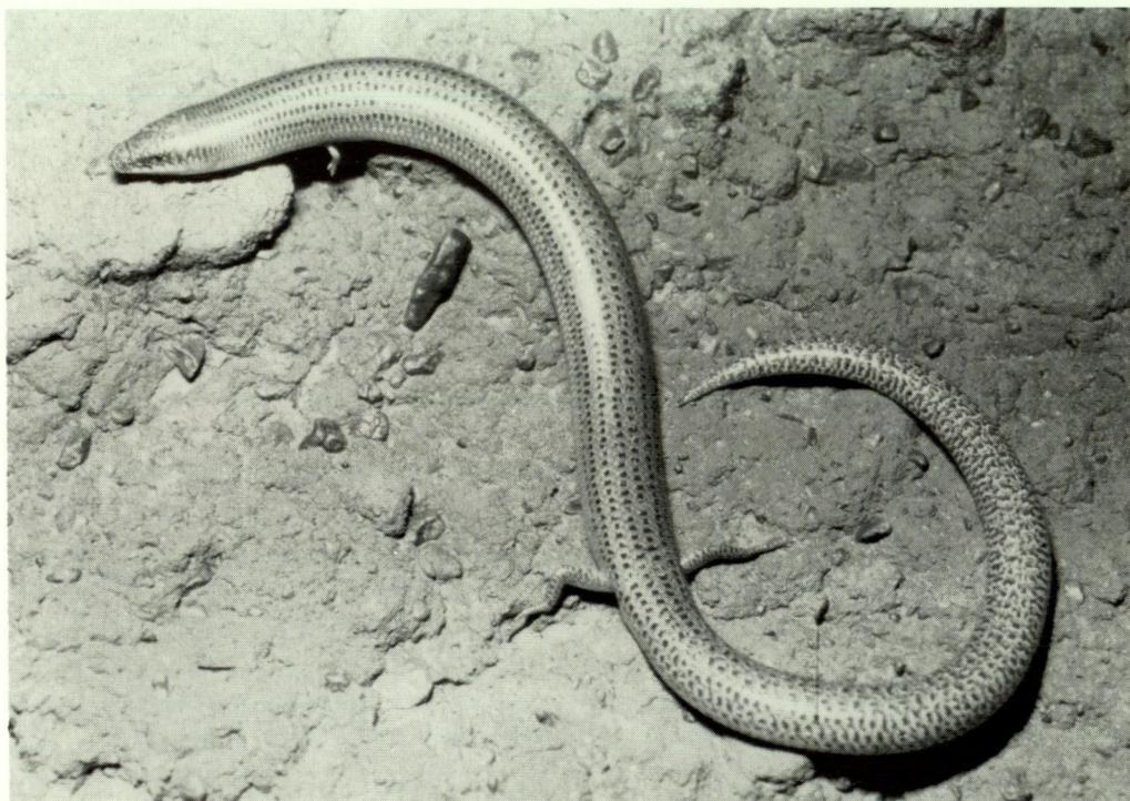
Figure 5 A Lerista neander from 21 km SE Bulloo Downs, photographed in life by R.E. Johnstone.

Arid western plateau of Western Australia from the eastern Hamersley and Ophthalmia Ranges south to the head of the Gascoyne.