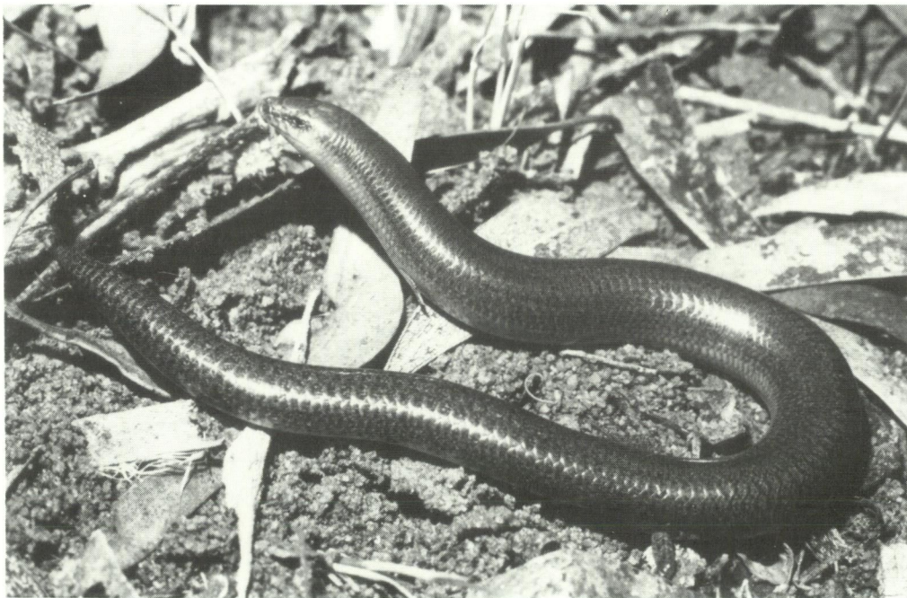
Figure 2 A Lerista m. macropisthopus from Bungalbin Hill, photographed in life by G. Harold.

Eastern Division (WA) : Dead Horse Rocks (85260-4); 3 km N Jeedamya (24043); 14 km ENE Comet Vale (65824, 72716) and 3 km NE (72744); Blue Hill (64816); Evanston (64817); Mt Manning Range (64764-5, 64788-9); 25 km NE Pittosporum Rockhole (67158, 67168-70); near Mt Jackson (67027, 67046, 72086, 76107, 76111, 76129); 15 km NE Bungalbin Hill (76188) and 12 km NNE (72134); 3 km S Walyahmoning Rock (95866, 95938).