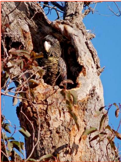
Female Forest Red-tailed Black Cockatoo at nest