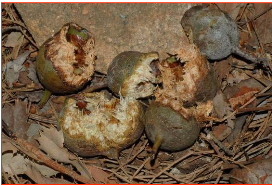
Marri nuts chewed by Forest Red-tailed Black Cockatoo