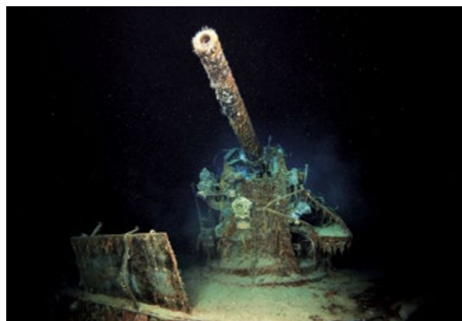
HMAS Sydney (II)

From Great Depths is a poignant, multimedia exhibit exploring the history of both ships and the exact moment they engaged in battle off the West Australian coast. Visitors will view a 3D film featuring the underwater footage captured during the 2015 survey expedition to the wreck sites, along with personal accounts and historic images of wartime service related to both crews.