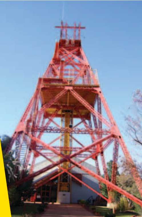
Western Australian Museum – Kalgoorlie-Boulder Hannan Street, Kalgoorlie

The Museum is conveniently located on Hannan Street, and not far from one of the richest gold deposits in the world.