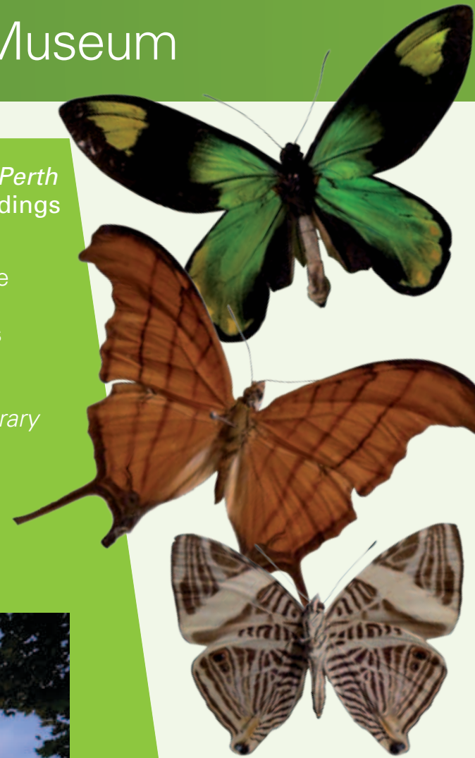
Western Australian Museum – Perth Perth Cultural Centre, James Street, Perth Open 9:30am - 5:00pm on school days