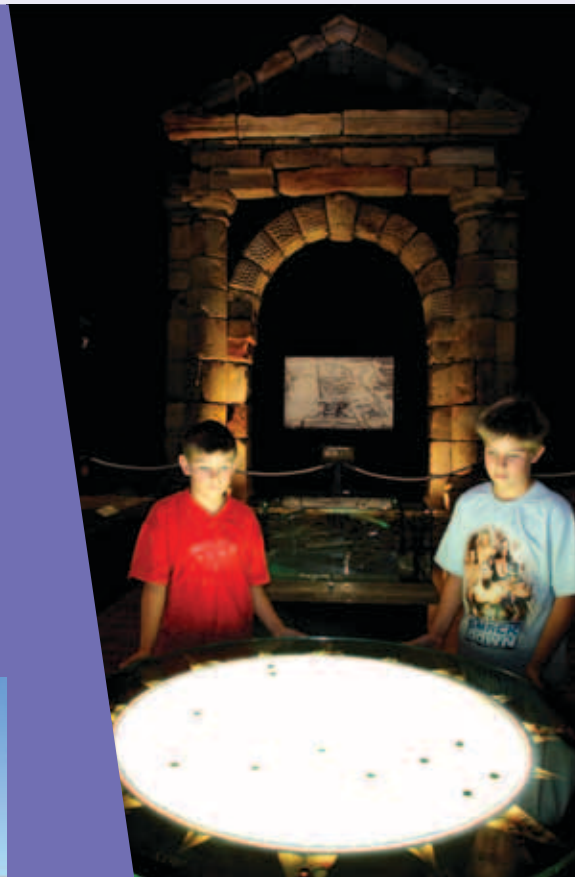
Western Australian Museum – Geraldton Museum Place, Batavia Coast Marina, Geraldton