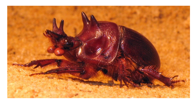
A common south-western Australian earth-borer beetle, Blackbolbus frontalis, male

Earth-borer beetles are members of the scarabgroup and have become of special interest in recent years because of their association with underground fungi, particularly those that form symbiotic associations with plant roots. Such fungi (termed 'mycorrhizal') assist plants to obtain essential minerals from the soil and many (if not most) of our native plants are dependent on the fungi for their health. The beetles feed on the underground fruiting bodies of the fungi and help spread their spores. Studies at the WA Museum in collaboration with the WA Herbarium have begun documenting which kinds of fungi are eaten by each species of earth-borer. WA Museum studies have focused on the life-histories of the beetles which are extremely poorly documented.