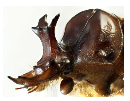
Males of three Bolborhachium species (B. recticorne, B. tricavicolle and B. coronatum, respectively). Their characteristic horns and other projections are fully developed only in the largest individuals and may be reduced or absent in smaller males. Not all kinds of earth-borers exhibit such adornments.