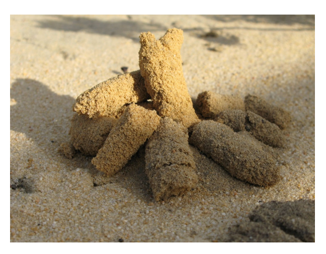
A 'push-up' or tumulus of an earth-borer beetle above the entrance to its burrow.

Usually, each burrow is marked on the surface of the ground by a characteristic pile of excavated soil. Termed a 'push-up', the pile is formed as the beetle pushes loads of loosened damp sand up from below. Periodically, a column of damp sand is forced out of the burrow entrance like tooth-paste from a tube. One by one, the columns dry, topple over and accumulate to form a pile of cylindrical lumps looking much like a cluster of mammal droppings (see image below).