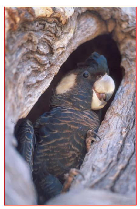
Female Carnaby's Cockatoo at nest