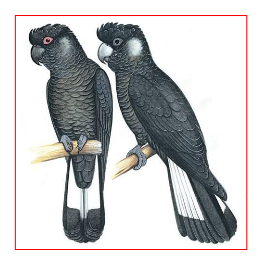
Male (left), Female (right)