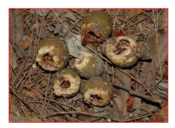
Marri nuts chewed by Carnaby's Cockatoo