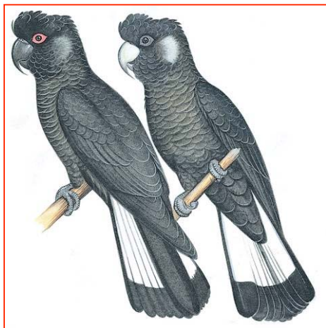
Male (left), Female (right)