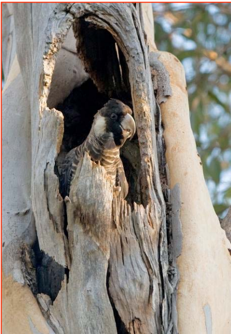
Female Baudin's Cockatoo at nest