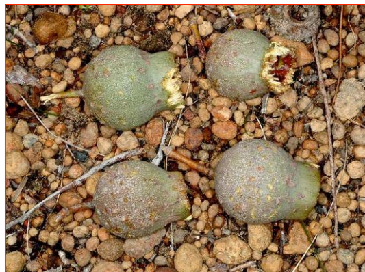
Marri nuts chewed by Baudin's Cockatoo