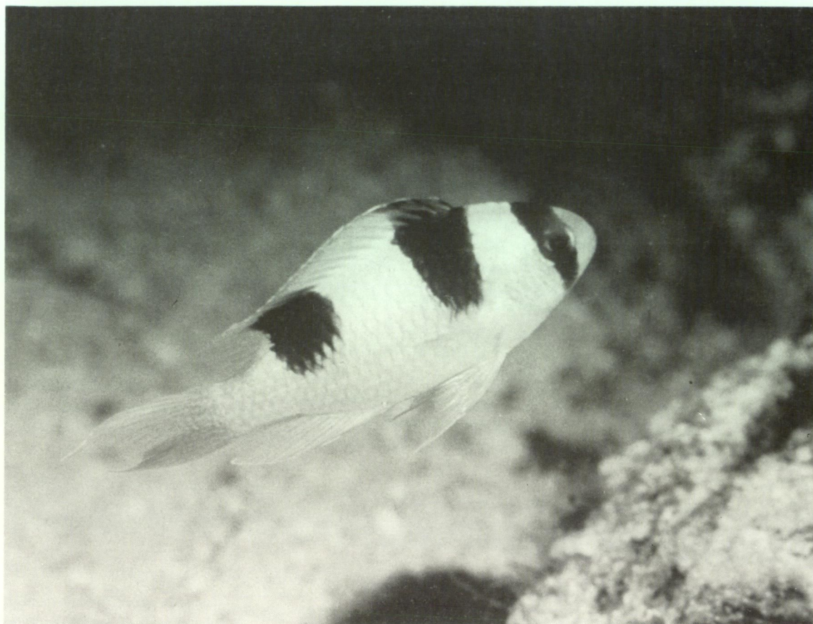
Figure 1 Amblypomacentrus clarus , holotype, 40.3 mm SL, photographed underwater at Banggai Island, Indonesia in 18 m depth.