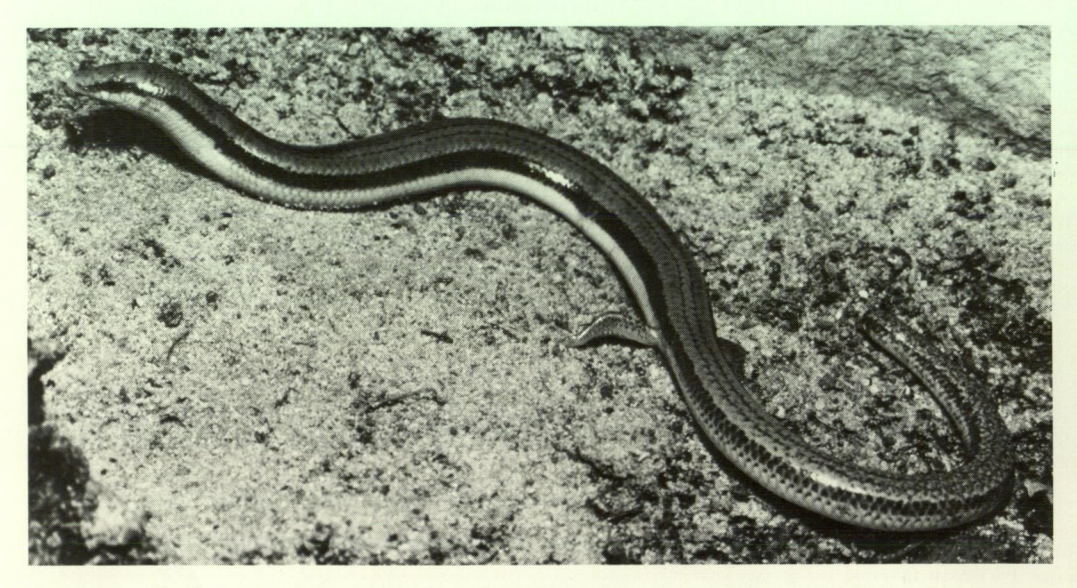
Figure 1 A paratype of Lerista simillima from Ellendale, photographed in life by G. Harold.

Upper surfaces pale brown. Head sparsely to moderately spotted with dark brown. Back and tail with two paravertebral lines of small dark brown spots. Wide blackish-brown upper lateral stripe from nostril to end of tail. Ventral and lower lateral surfaces whitish.