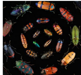
Revealing the Museum Behind the scenes of the WA Museum