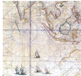
Exploring the World WA and its place in the world