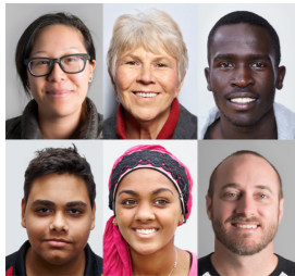
Being Western Australian Celebrating the diversity of our people