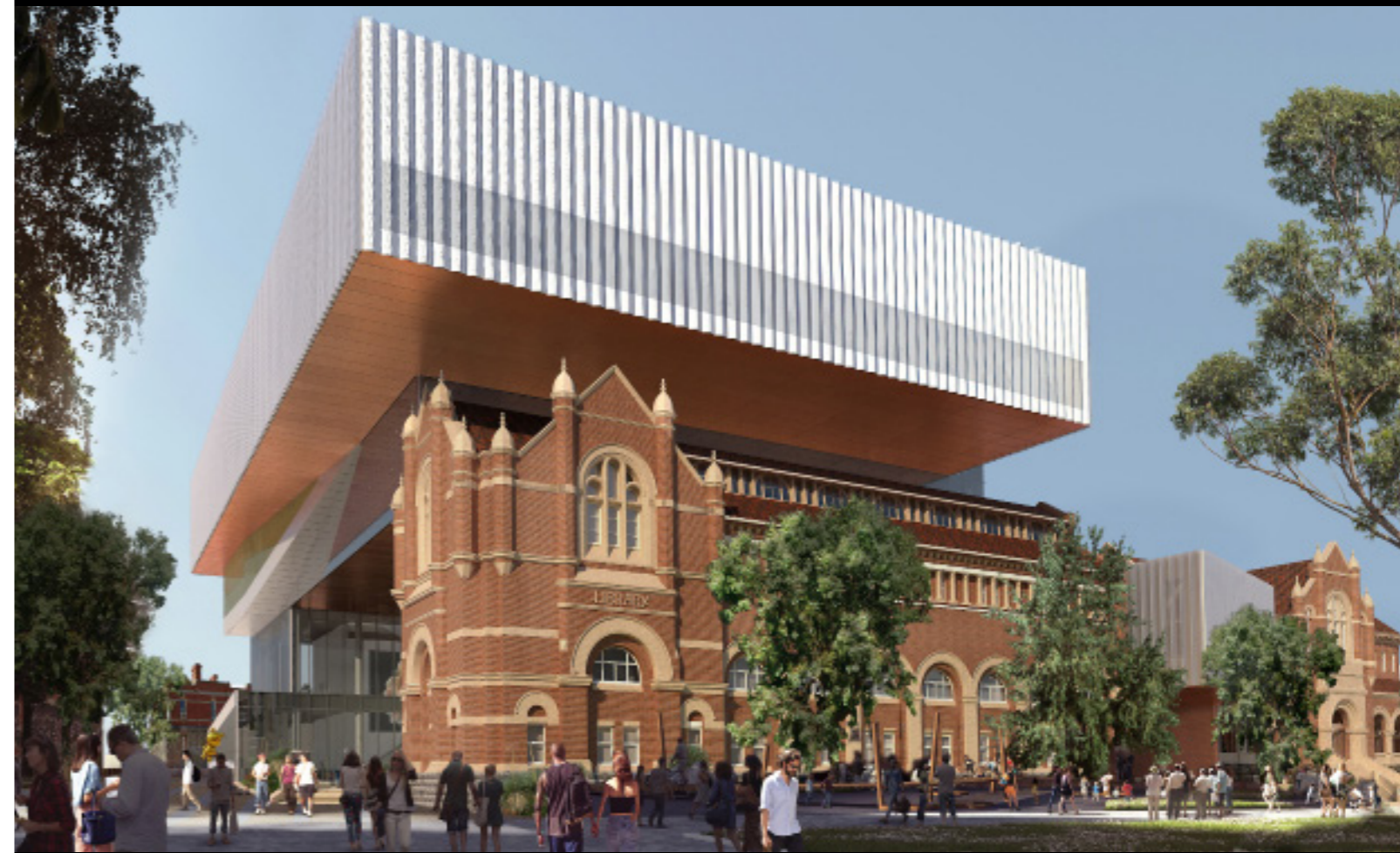
The New Museum for Western Australia

Our new world-class museum will be the heart of our State and reflect the spirit of its people. It will be an important part of Perth's cultural precinct and be owned, visited and valued by all Western Australians and admired by the world – a major attraction for visitors to our State.