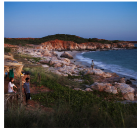
Discovering WA A gateway to our incredible State