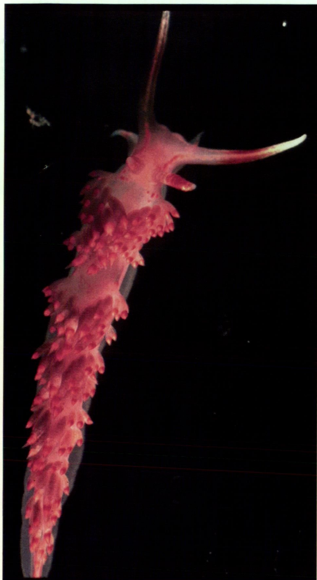
Figure 1 Photograph of living specimen of Australaelis stearnsi (Cockerell, 1901) photo by T. Gosliner.

(Figure 2A). The largest arch is the most anterior on each side and consists of 28–30 cerata. The cerata are translucent from the base terminating with a broad band of orange/vermillion to yellow and tipped with white. The rhinophores are annulate and have 10–15 annulae each. The upper half of the rhinophores transition from yellow to orange/vermillion, with a white tip. Both the oral tentacles and the tentacular anterior foot corners have an orange mid-region and an opaque white tip. The long tapering oral tentacles also have a white or cream line that runs along the dorsal side and then across the head to the base of the rhinophores. The line is often orange/yellow toward the base of the rhinophore. There are irregular spots of orange/vermillion behind the rhinophores and between each group of cerata. A white to orange line runs dorsally from the posterior cerata cluster to the tip of the foot. The anus is located ventral and within the second cluster of cerata. The genital aperture is