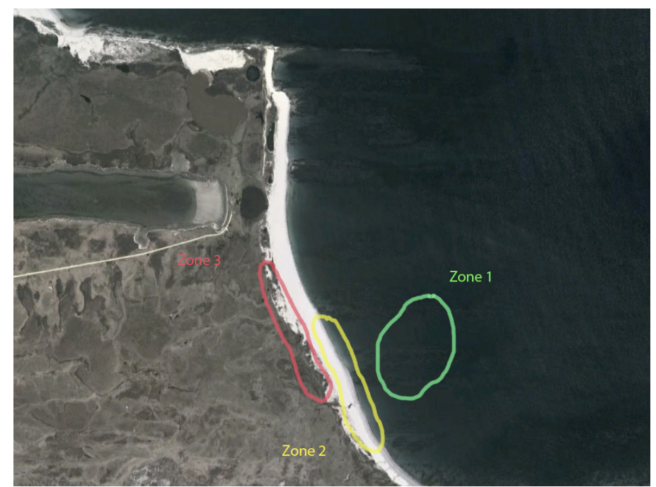
Figure 1: Approximate location in Uranie Bay (Berkeley Sound, Falkland Islands) of the three archaeological zones of the Uranie site (Google Earth)

...a main body of wreckage offshore at Uranie Bay; a wreckage 'plume' on the seabed from there to the shore; wreckage cast ashore (from the southwestern head of the bay through to the beach opposite the farmhouse); and a survivor's camp that lies between two streams in the middle of the bay (2002:72).